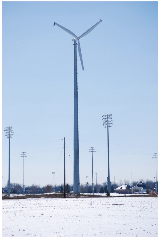
Figure 2. One of two 50 kW turbines in near Zeeland, Michigan. Each tower is 125 feet tall.

As recent experiences in West Michigan demonstrate, varieties of groups organize and become involved in the process of reviewing a wind energy project. An analysis of wind energy projects in England, Wales, and Denmark found that projects “with high levels of participatory planning are more likely to be publicly accepted and successful” [7, p. 2658]. High levels of information and public participation were also associated with successful projects in France and Germany [8]. Stable supporting networks are more likely to form when public participation is high. However the presence of these groups is not mandatory for project acceptance and deployment. More important to deployment was the presence of opposition groups. The absence of a stable network of opponents was linked to project acceptance and deployment [7]. The knowledge, attitudes, and values that West Michigan residents hold about energy development, quality of life, and the community engagement process may similarly influence public participation.