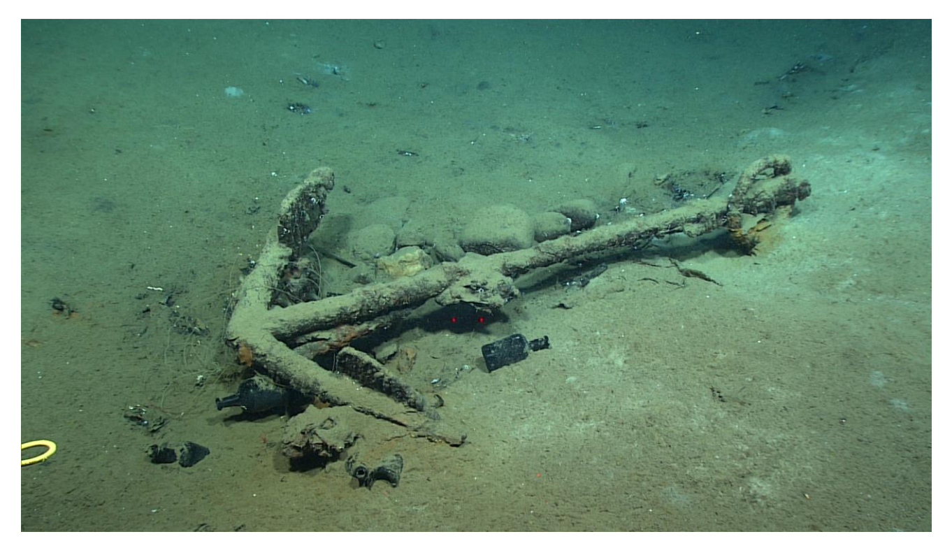
As part of the shipwreck found was an anchor with glass bottles scattered around and some wood preserved from the original ship.