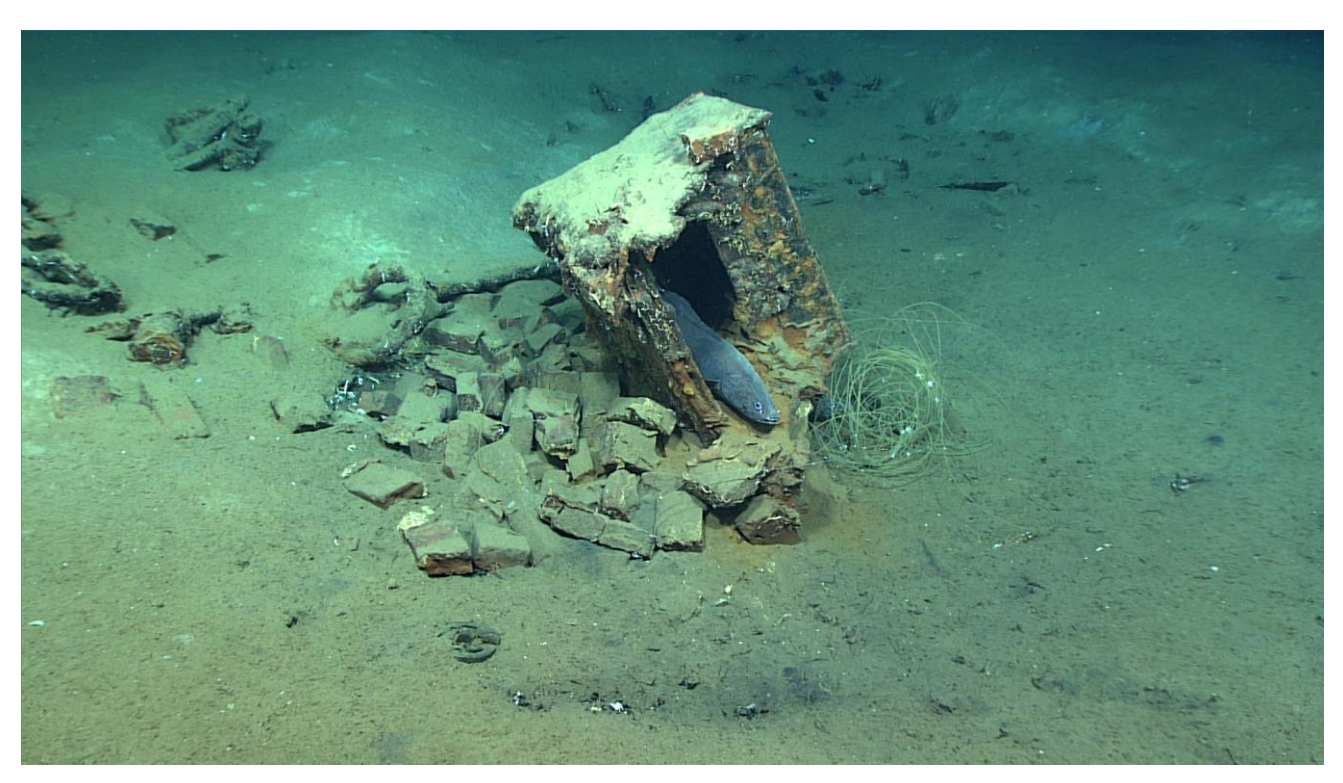
A stove for burning whale blubber was found as part of the shipwreck with bricks scattered about and a fish commonly associated with shipwrecks. Fishing line was observed partially coiled up.