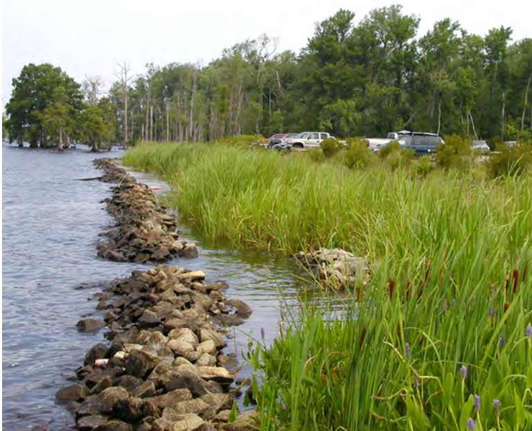
Living Shorelines Project at the Edenhouse Boat Ramp, Edenton, NC

Agency leadership would also be valuable in broadening planning perspectives and working across jurisdictions to collaboratively achieve meaningful regulatory reform.