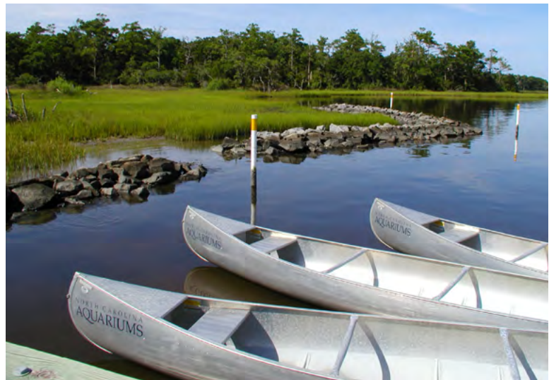
Living Shorelines Project at NC Aquarium at Pine Knoll Shores

Decision-making without consideration of the broader context also fails to consider the multiple values created by living shorelines and overlooks their systemic advantages, both to the landowner and to other users of the estuary. (See IV, G, above). System-wide planning is also a vehicle for living shorelines to provide mitigation for unavoidable habitat loss elsewhere in that system.