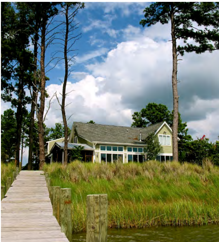
Living Shorelines Project, MD

THE BOARD OF DIRECTORS OF RESTORE AMERICA'S ESTUARIES HAS REVIEWED AND ENDORSED THE FINDINGS AND RECOMMENDATIONS OF THIS REPORT