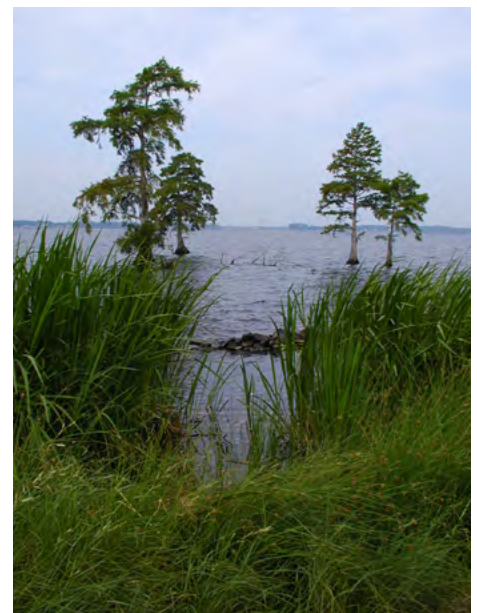
Living Shorelines Project at the Edenhouse Boat Ramp, Edenton, NC; ©Tracy Skrabal

The EPA developed CWA § 404(b)(1) guidelines, which establish the environmental criteria for evaluating a project under the federal wetlands permitting program. 71 The § 404(b)(1) guidelines require the selection of a practical alternative that is the least damaging to the environment. Since it is now clear that living shorelines are generally the least damaging management