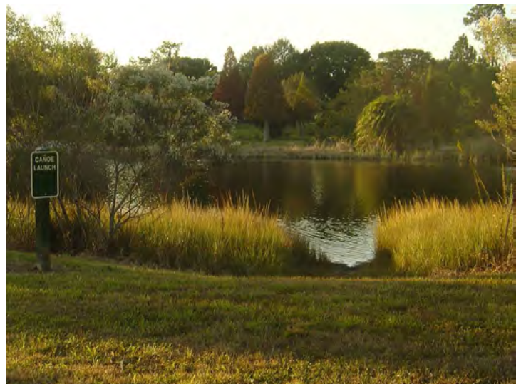
Living Shorelines Project, Rivercrest Park, Tampa, FL

Successfully pursuing these strategies will require a vigorous dedication to substantively reforming how we are managing our shorelines. Dedication alone will not be enough. Leadership and coordination of efforts will be necessary to effect change. In the committee's opinion, significant leadership can be provided at this stage by the non-governmental organization (NGO) community working together in a focused way to advance these strategies. It is important that all living shoreline constituencies, public or private, be involved in the effort to bring about the needed reforms to overcome institutional barriers.