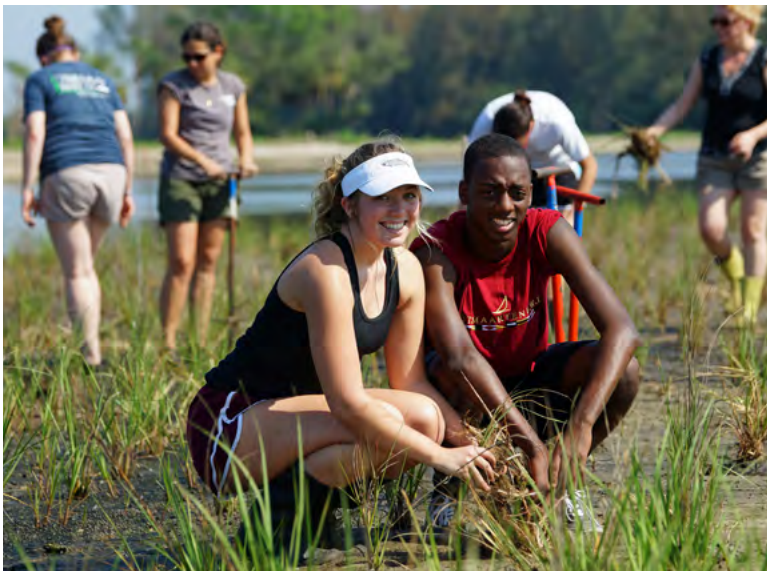
Rock Ponds Restoration, Tampa Bay

Finally, the private sector capacities can be increased by partnering with NGOs and other volunteers. The examples of NGOs providing volunteer labor and lowering construction costs for living shoreline projects are myriad. By utilizing these resources, the economics of living shoreline projects are enhanced while providing significant public education and expansion of advocacy base opportunities.