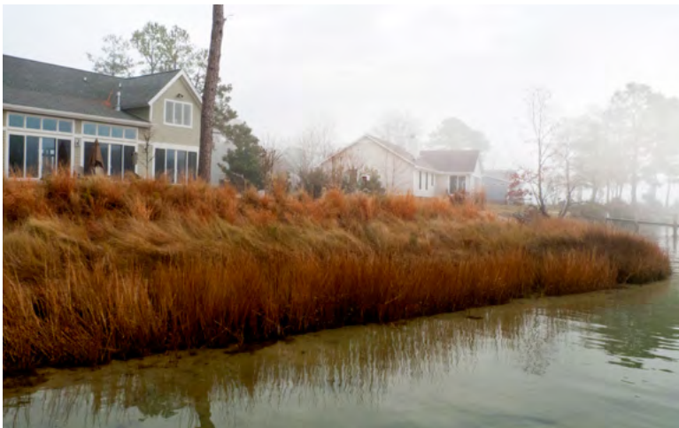
Fish Camp in the Fog, MD

As discussed earlier, current research demonstrates the many benefits to clean water and healthier estuarine ecosystems flowing from the use of living shorelines instead of continued hardening. The values generated for the public—clean water, healthy fisheries, superior recreational resources, improved property values and tax base—all should be of significant importance to government at all levels. In addition, the use of living shorelines as a method of complying with TMDL mandates (as is about to happen in MD and VA) is an example of a direct benefit to the public agencies charged with achieving compliance with the CWA, and therefore of direct economic benefit to the taxpayers of that jurisdiction. Government support for living shorelines could also encourage new and innovative designs and techniques for using living shorelines.