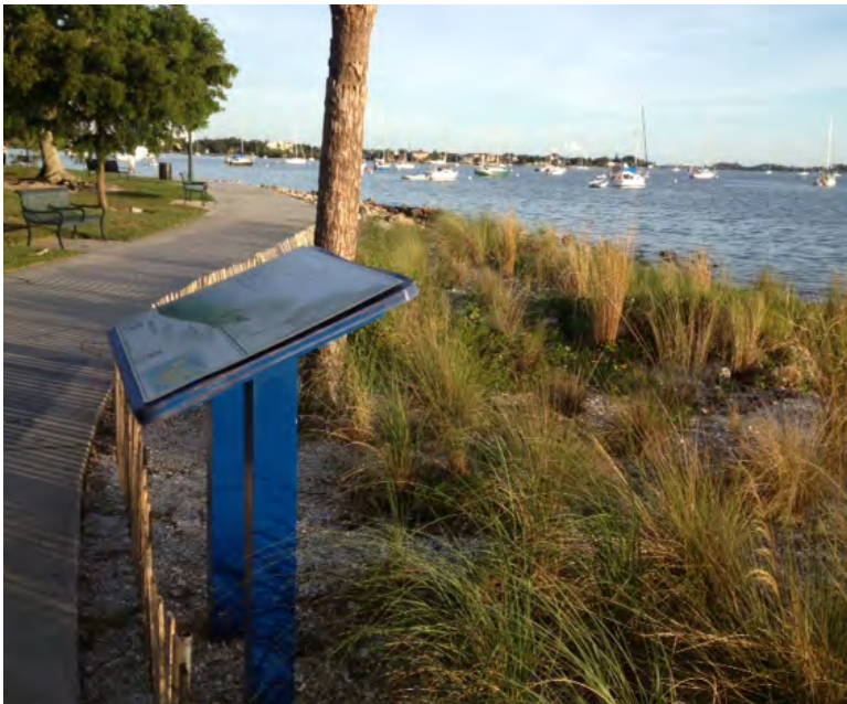
Living Shorelines Project, Bay Front Park, Sarasota, FL; ©Thomas Ries

This coordination across agencies can be accomplished in several ways. At the federal level, the possibility of an MOU between the many agencies affected by living shoreline issues (e.g., EPA, Corps, Department of Defense (DOD), Department of the Interior, Department of Commerce, etc.) should be explored. This approach is especially critical in light of the other federal priorities described above which are currently unaddressed in shoreline permitting. At the state-federal interface, many jurisdictions have already implemented a joint-permitting process for shoreline projects as a means to coordinate project review. States should also work with federal regulators to develop RGP's for living shoreline installations.