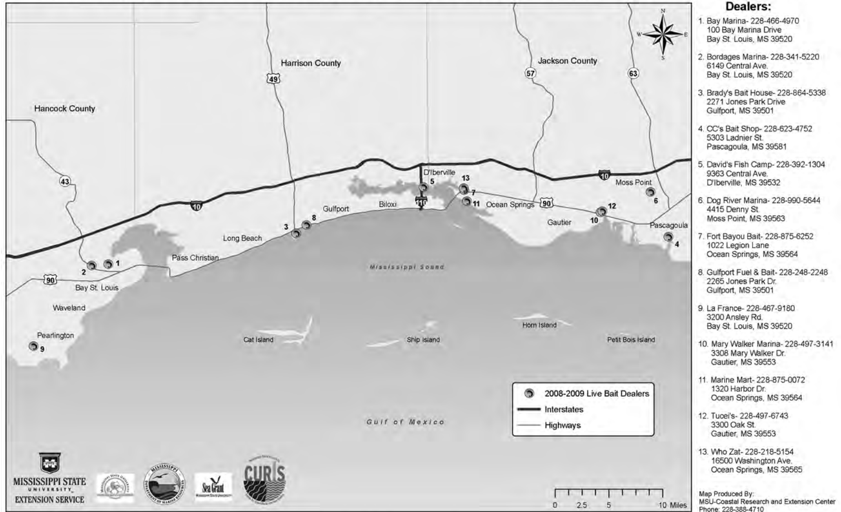
Figure 2. Licensed Livebait Shrimp Dealers in Mississippi, 2008–2009 Season.