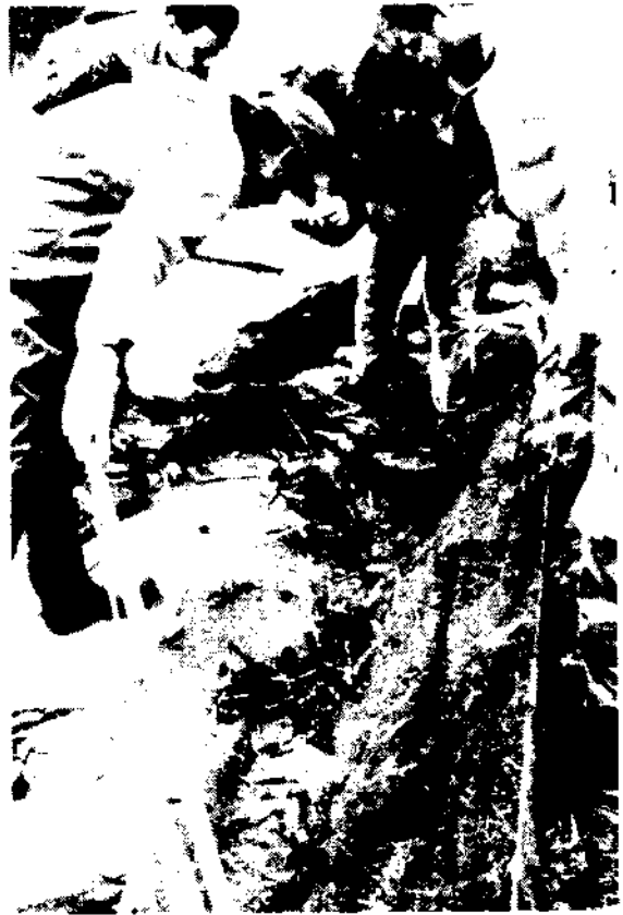
Envirovet students examine their catch in a seine used in an iron-ore impacted sound in Lake Superior. Through this, students learn population assessments and environmental pathology techniques.