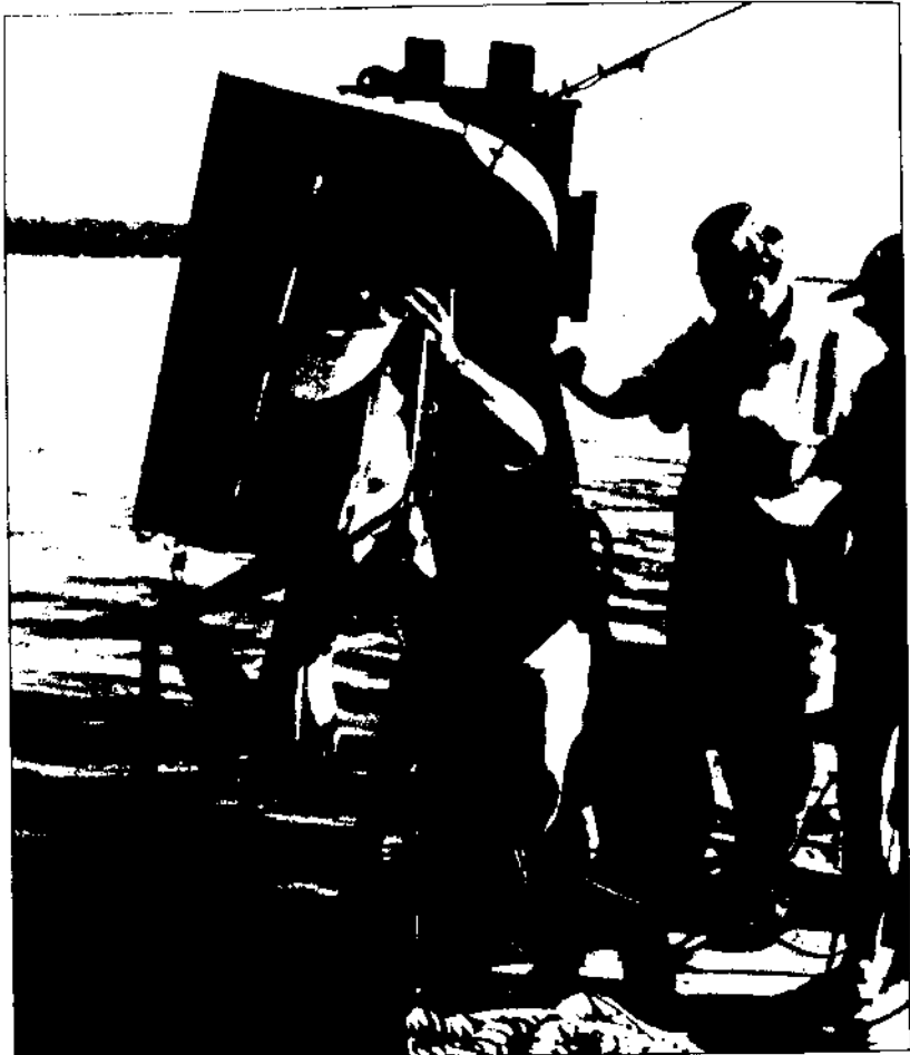
An Envirovet participant prepares to submerge a plankton tow into the waters of Lake Superior. The water collected in the tow will be analyzed to determine the biodiversity of the lake's food chain.

Envirovet has been funded by the Great Lakes Protection Fund, the Illinois-Indiana Sea Grant Program, and Dow Chemical Company. A faculty of more than 40 experts in their respective fields includes individuals from the three sponsoring universities, the EPA, the US Fish and Wildlife Service,