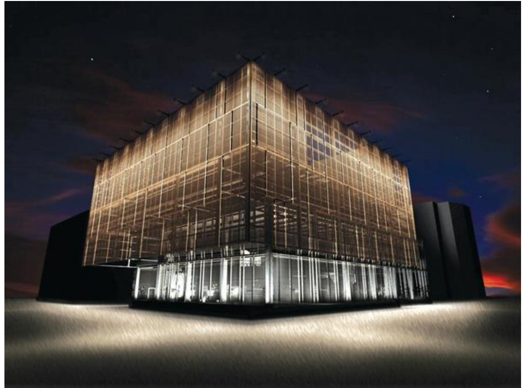
Chiller plant at Ohio State University