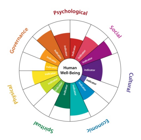
Figure 2. Framework identifying domains of human wellbeing relevant to Puget Sound recovery

Puget Sound aesthetics, sense of place and recreation have been funded by the Puget Sound Institute (PSI). Also partially stimulated by this workshop, a recent effort supported by NSF, Stanford University and the Puget Sound Institute resulted in a conceptual model and framework for understanding the relationship of Human Dimensions and Human Wellbeing in recovery, intending to guide future research and monitoring and the integration of resulting data into recovery planning (Figures 1 and 2).