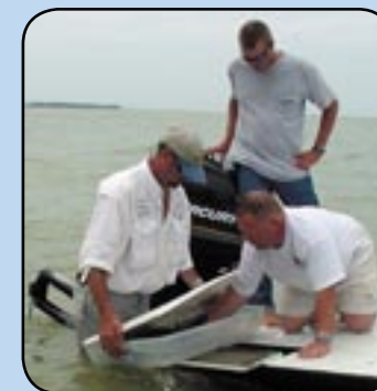
Fishermen should transport fish using shallow plastic fish boxes.