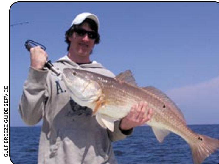
GULF BREEZE GUIDE SERVICE

IMPORTANT: The proper use of BogaGrips® requires supporting the belly of the fish and keeping the fish in a horizontal position. Holding the fish vertically will tear mouth and jaw cartilage and cause internal damage.