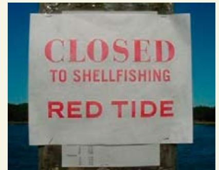
Bill Walton, Sea Grant/CCCE

With the 2005 outbreak of red tide, Woods Hole Sea Grant rushed to provide information about red tide to concerned fishermen, seafood consumers, visitors and government officials.