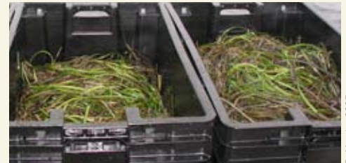
D. Murphy, CCCE

Efforts to restore eelgrass are not new, but none have achieved unqualified success. To date, restoration efforts have required large investments of labor (often volunteered), exhibited poor success, or both. Despite these problems, the importance of eelgrass—as well as bay scallops—prompted Woods Hole Sea Grant to explore potential restoration options.