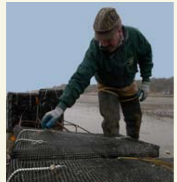
Massachusetts shellfish officers are involved in a wide array of activities.