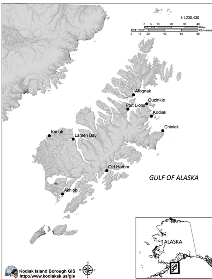
Fig. 1. Map of the Kodiak Archipelago.

fishery systems by creating entrenched social classes and substantially altering rural fishing communities and livelihoods. Below a young fisherman explained these generational differences as well as value tensions embedded in treating fisheries access rights as commodified assets: