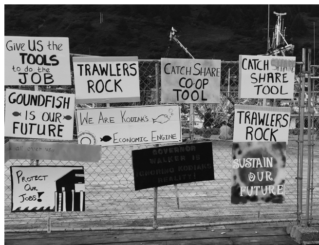
Fig. 3. Trawl groundfish parade posters during the NPFMC meeting in Kodiak, June 2016.

Furthermore, discourse shifts evidenced in two posters displayed in Kodiak during NPFMC meetings in Kodiak in 2006 (Fig. 2) and 2016 (Fig. 3) illustrate a growing prevalence of pro-IFQ, or catch share language, as well as a broader shift towards normalizing and popularizing