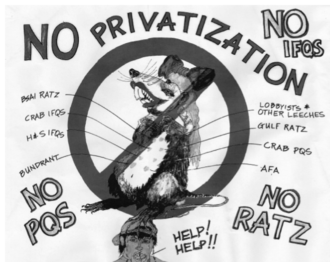
Fig. 2. Anti-privatization poster by Ludger Dochtermann from 2006.

Just this last month I did halibut and that's an obvious example of the