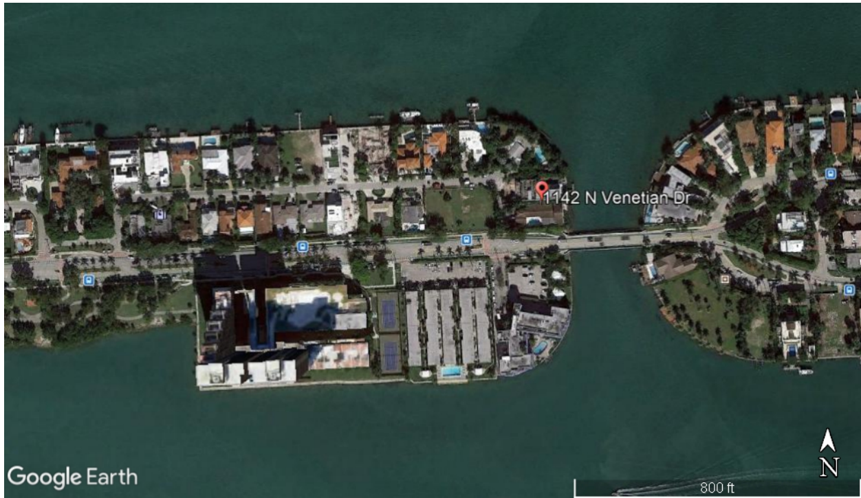
Figure 1. Image showing the project site (red pin) on Biscayne Bay at 1142 North Venetian Drive, Miami Beach, Miami-Dade County, Florida

The proposed project site is located at 1142 North Venetian Drive, Miami Beach, Miami-Dade County, Florida (25.790694°N, 80.171996°W [North American Datum 1983] (Figure 1). The project site is located approximately 3.1 miles from Government Cut, the nearest inlet to the Atlantic Ocean.