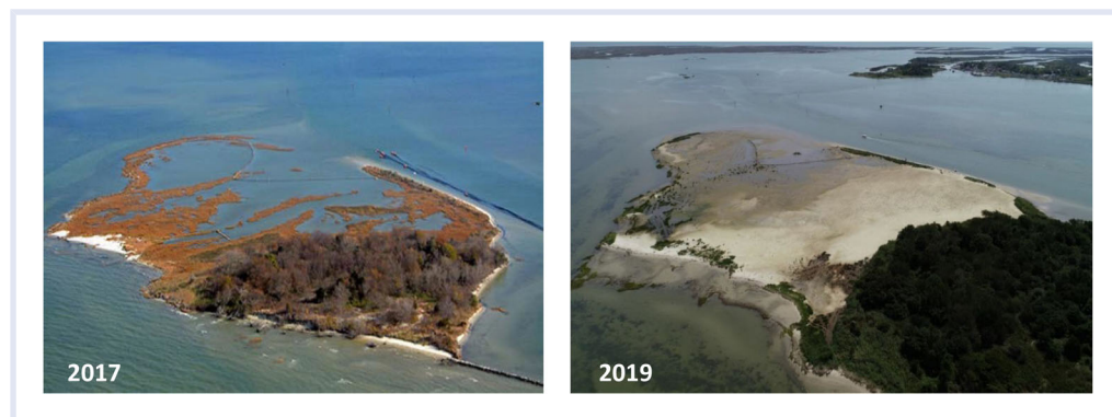
FIGURE 2 Aerial images of Swan Island before (left) and after (right) sediment placement and planting

NBS like Swan Island involve the intentional alignment of ecology and engineering for the purpose of shoreline protection. These two disciplines are inextricably linked when it comes to the restoration of coastal ecosystems. As a result, efforts to evaluate their performance require diverse expertise from both fields. Engaging potential partners early in the NBS planning process is critical not only for ensuring that a range of disciplines are represented but also for help in shouldering both the cost and workload. EWN also