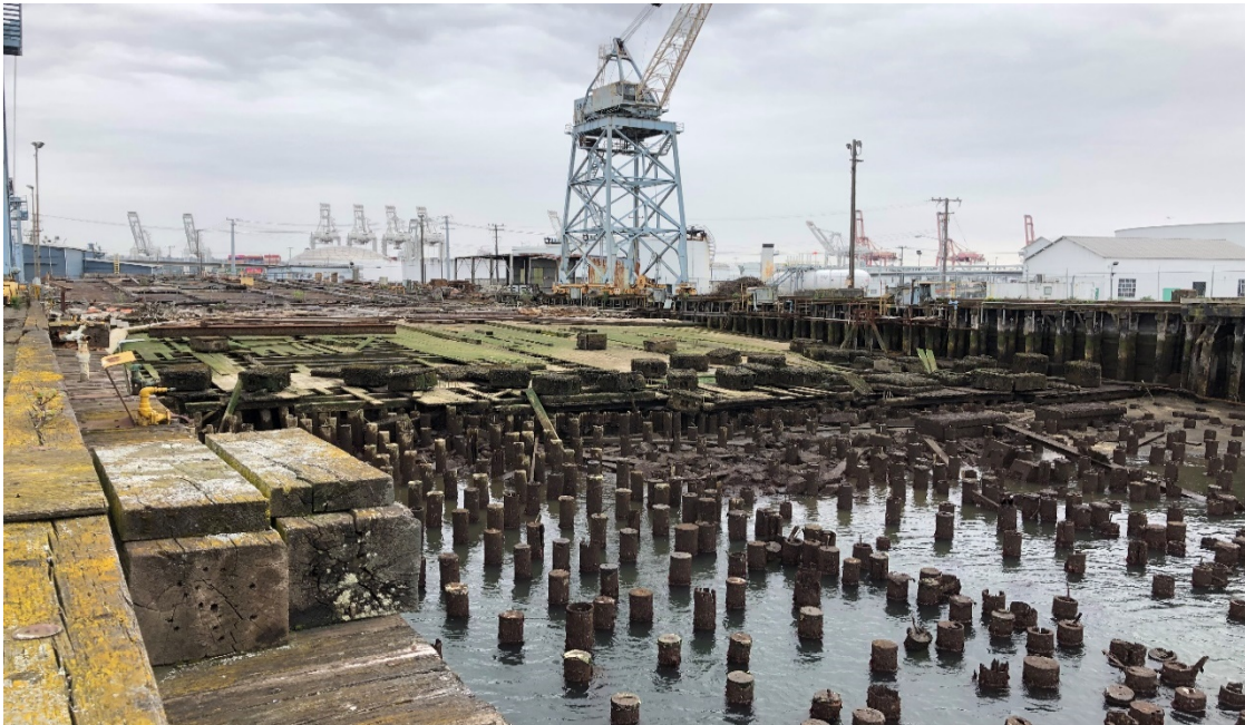
(Vigor shipways to be demolished for Southwest Yard Habitat Project.)

Historically, the LDR was forestland, intertidal flats, and freshwater and estuarine wetlands. Beginning with industrialization in the early twentieth century, the LDR became increasingly altered and is now mainly industrial and residential development. The LDR is restricted along both banks by levees or rock revetments and is periodically dredged between its mouth and river mile 5.5. Approximately 99 percent of the former estuarine wetlands and mudflats have been either dredged or filled for industrial purposes (U.S. Department of the Interior, Fish and Wildlife Service, 2000; U.S. Army Corps of Engineers, 2000).