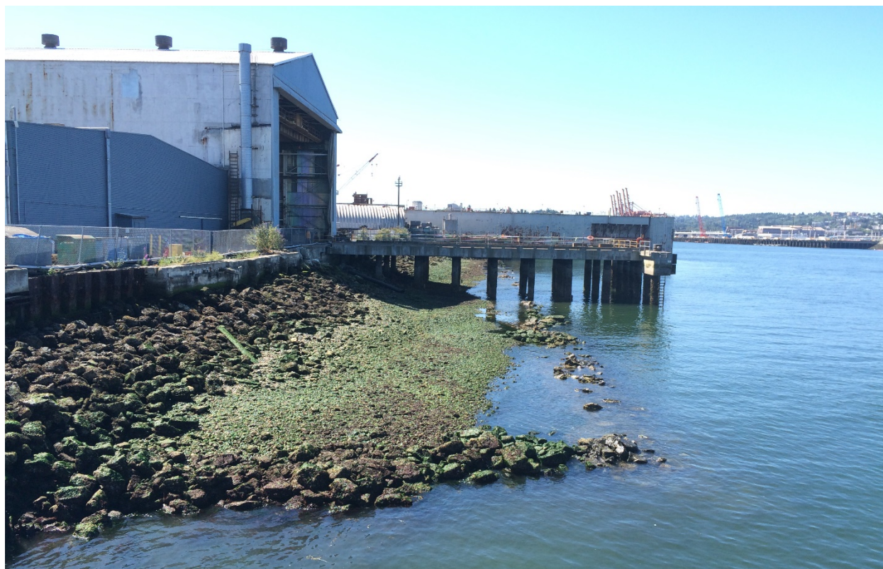
(View of West Waterway Habitat Bench Project, looking south.)

creation and conservation. Vigor and Exxon would be required to monitor and maintain the WW Bench Project for the initial 30 years after the entry of the consent decree to guarantee that the WW Bench Project habitat will continue to function to support natural resources injured by hazardous releases and discharges of oil. After the initial 30 years, the Trustees would require Exxon and Vigor to implement a long-term stewardship plan. Implementation of the permanent protection and monitoring and maintenance requirements for the WW Bench Project is contingent on the Court entering the consent decree between the Trustees, Exxon, and Vigor.