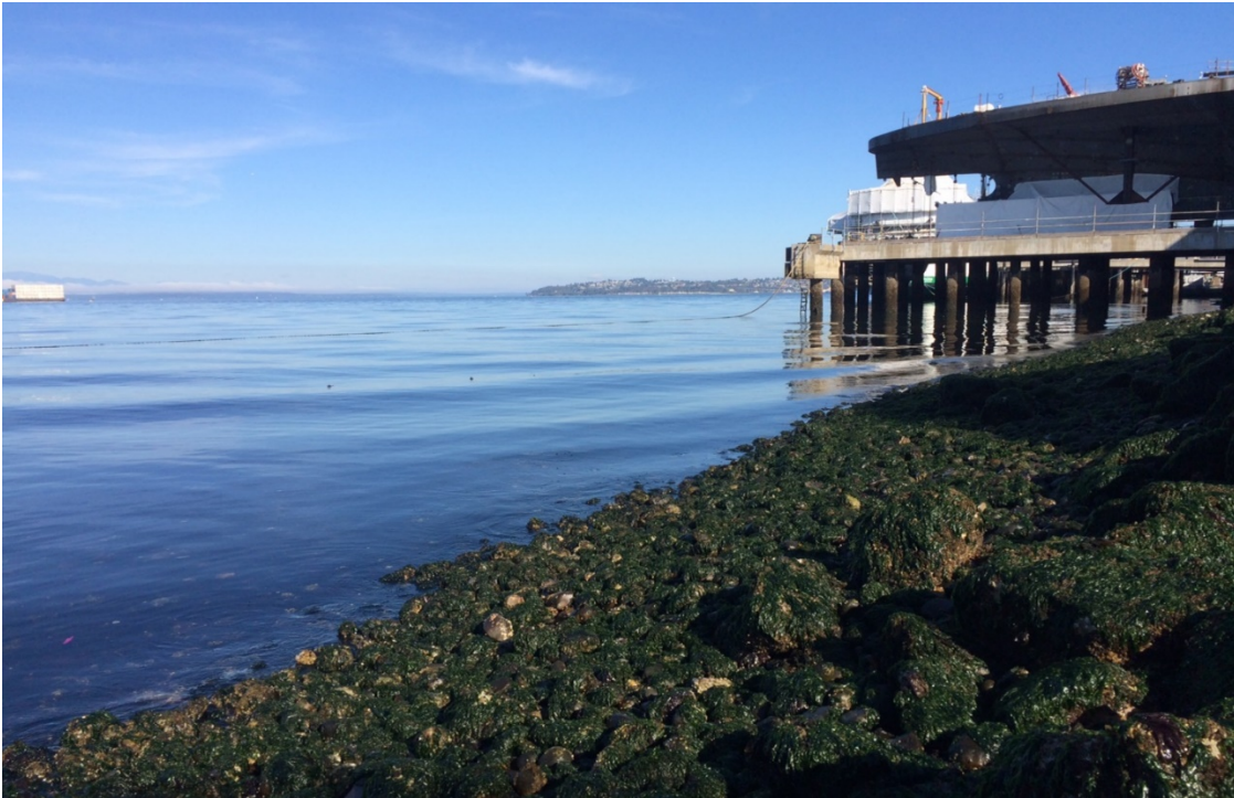
(View looking north of the West Waterway Habitat Bench Project.)