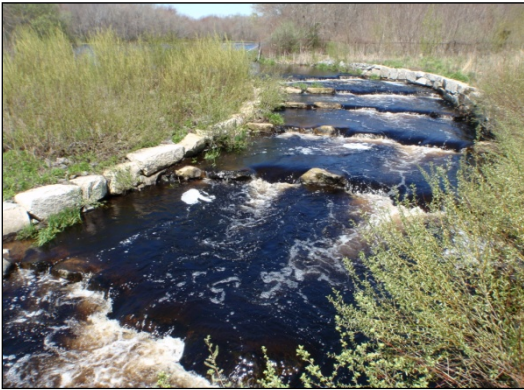
Saw Mill Park step-pool fishway, Acushnet River, Acushnet, MA