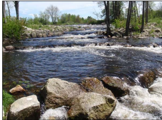
Fields Pond step-pool fishway, Sedgeunkedunk Stream, Orrington, ME