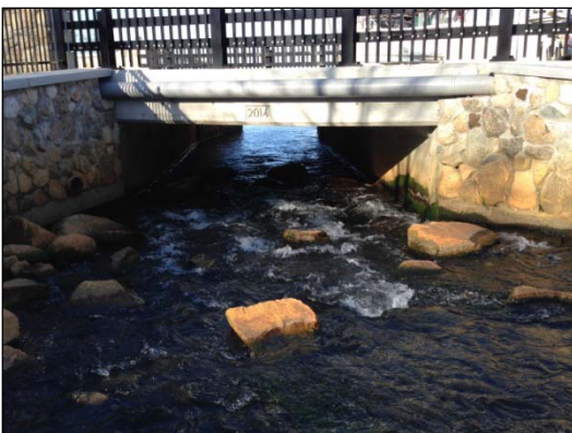
Water Street tidal rock ramp, Town Brook, Plymouth, MA