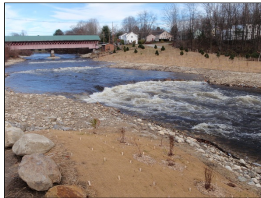
Homestead dam removal and NLF cross-vanes, Ashuelot River, West Swanzey, NH