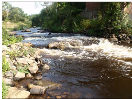
Lower Shannock Falls NLF weirs, Pawcatuck River, Richmond, RI