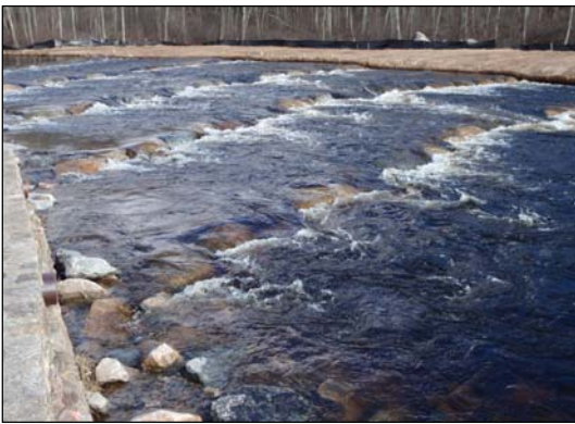
Kenyon Mill step-pool fishway, Pawcatuck River, Richmond, RI