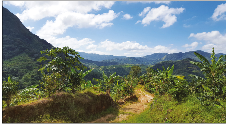
Figure 4. A coffee farm in the Cordillera Central, Puerto Rico. Ecologists are working with farmers in this mixed agricultural/forested landscape to understand native pollinator habitat preferences and pollination efficiency.

Hallett et al. (2017) discuss the need for professional incentives for ecologists to engage with stakeholders.