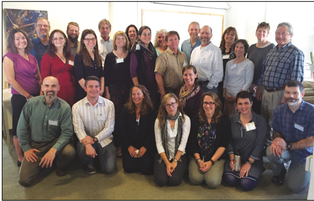
Figure 2. Members of the TE Working Group.