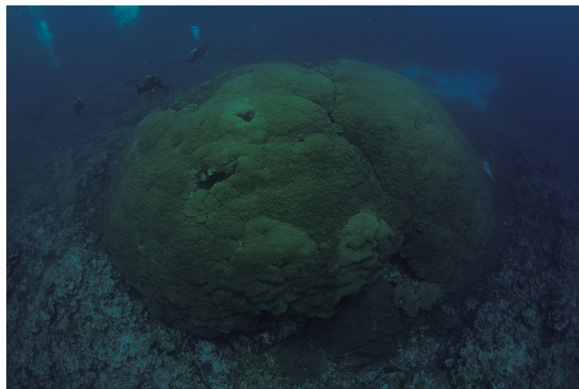
Figure 3. The newly identified and measured Porites sp. colony located in Ta'u, American Samoa.

between estimates of over 200 years for both corals is noteworthy and illustrates the variability associated with determining ages for long-lived species.