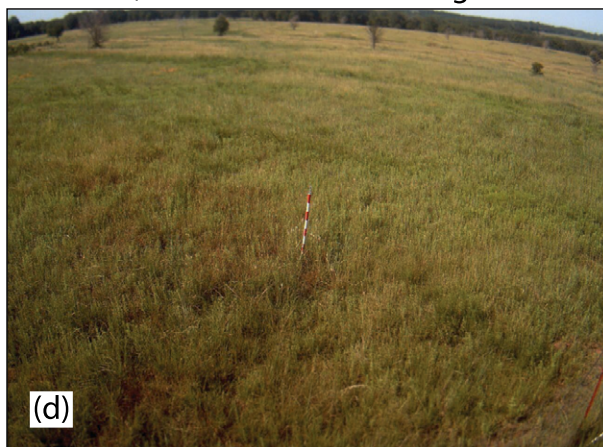
FIG. 3. Phenocam images taken at MOISST, which is adjacent to the Marena mesonet station, on (a) 1 Jul 2012, (b) 11 Aug 2012, (c) 1 Jul 2014, and (d) 11 Aug 2014. All images were taken at 1030 local time.

Testbed (MOISST; Cosh et al. 2016). In this example, the 2012 flash drought caused the grasses to rapidly brown and go dormant over a 6-week period, which stands in sharp contrast to the continued greenness over the same time period in 2014. A wide assortment of satellite-derived tools, such as the normalized difference vegetation index (Tucker 1979), enhanced vegetation index (Huete et al. 2002), and land surface water index (Xiao et al. 2002), computed using visible and near-infrared satellite imagery, can be used to provide high-resolution estimates of vegetation health during flash drought events.