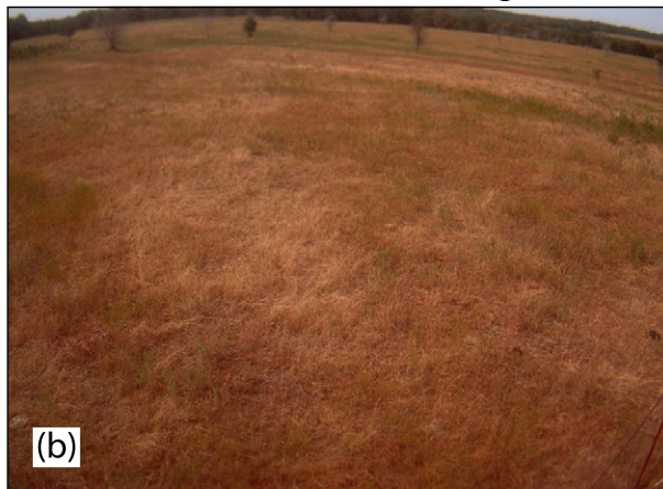
Marena, OK Phenocam - 11 August 2012