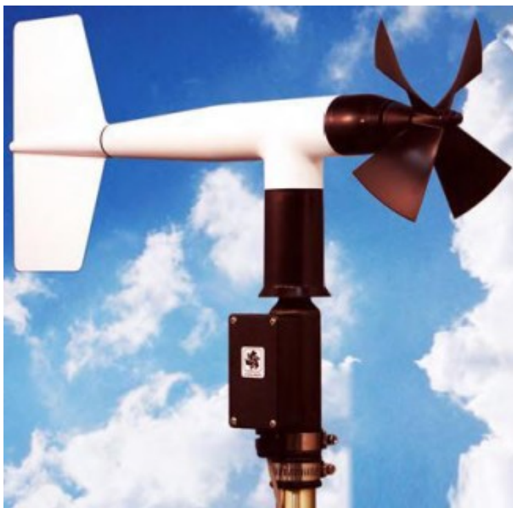
Figure 2-1. RM Young propeller and wind vane sensor (photo courtesy of RM Young).

The most predominant anemometer is an impellor/wind vane combination (often combined into one unit) used to measure wind speed/direction, respectively. Figure 2-1 shows an RM Young blade impellor mounted on a rotating wind vane. The impellor rotation can be detected magnetically, electrically, or optically; the pulsed output is used to determine the impellor speed of rotation. The wind vane rotation is often measured with a potentiometer, such that orientation is proportional to the observed resistance. A data collection platform (DCP) is used to capture the sensor output and apply a calibration to convert the observations to wind speed and direction. These instantaneous observations are then processed over a period of time to create the reported wind speed, direction, and gust. However, this technology does have several disadvantages. Impellers and wind vanes bearings tend to wear or corrode over time, have various start-up thresholds that may preclude low-wind observations, and are subject to damage if the blade strikes an object.