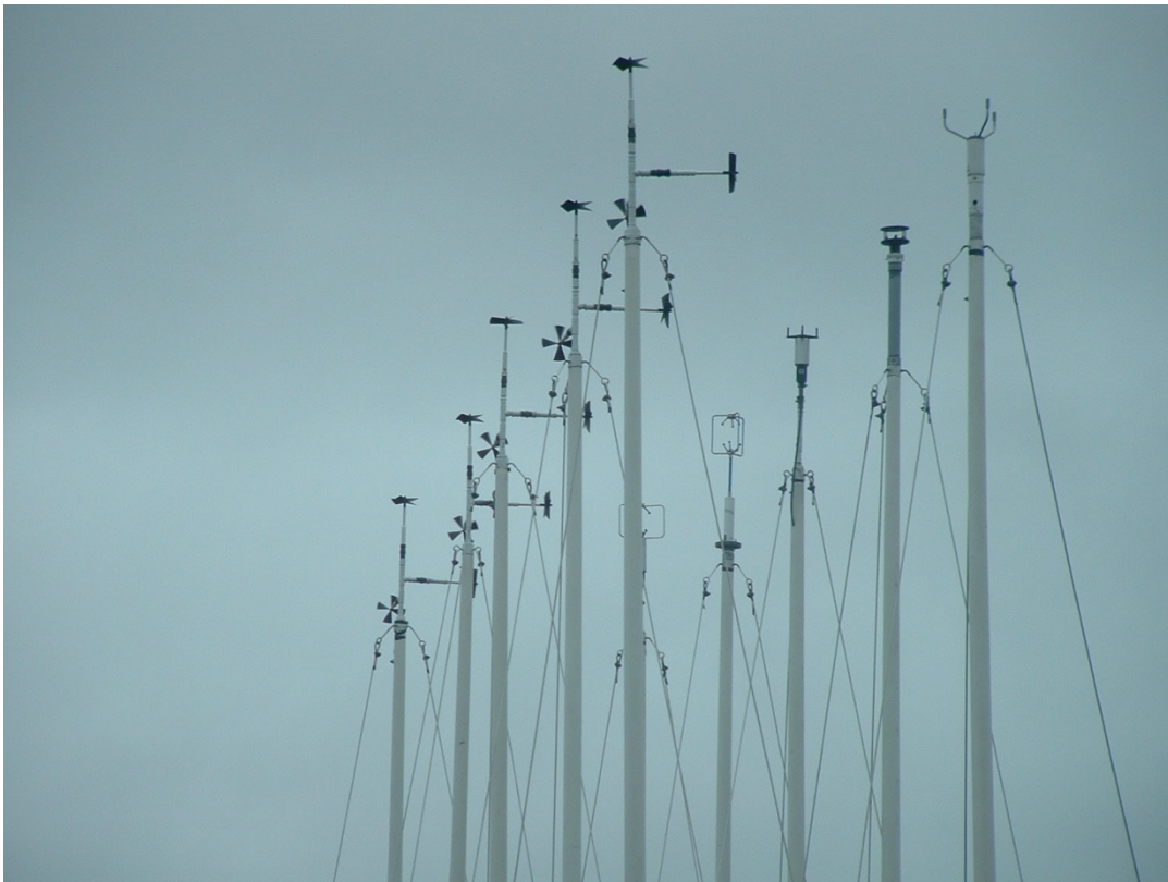
Figure 2-4. Acoustic anemometers at the Otis Weather Test facility in Cape Cod, Massachusetts. The five masts on the left provide reference wind observations. The five sensors on the right are: 1) RM Young 3-axis ultrasonic anemometer (partially obscured), 2) Gill R3 3-D anemometer, 3) RM Young 2-axis ultrasonic anemometer, 4) Gill Windsonic 2-axis ultrasonic anemometer, and 5) Vaisala WS425 ultrasonic anemometer.

Another popular technology uses ultrasound, either by observing changes in the time of flight of acoustic pulses between several emitter/receiver pairs, or more recently by detecting phase changes in a resonant acoustic wave. Figure 2-4 shows a variety of acoustic anemometers being tested at the Otis Weather Test facility in Cape Cod, Massachusetts. These electronic sensors usually include the circuitry needed to directly output calibrated wind speed, direction, and gust. In some cases, they can also generate an analog output that mimics an impellor/wind vane, easing the replacement of these devices with a sonic anemometer. They excel at observing the lowest wind speeds, but in some cases, the physical structure that supports the emitter/receivers also obstructs wind flow. The problem is most pronounced at extremely high wind speeds. Some sensors are also prone to failure because of roosting birds. Early acoustic anemometers accumulated water droplets on the emitter or receiver resulting in erroneous measurements, which are now readily detected and discarded by the sensor itself before outputting an observation.