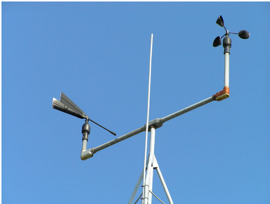
Figure 2-3. Close-up of a cup anemometer.