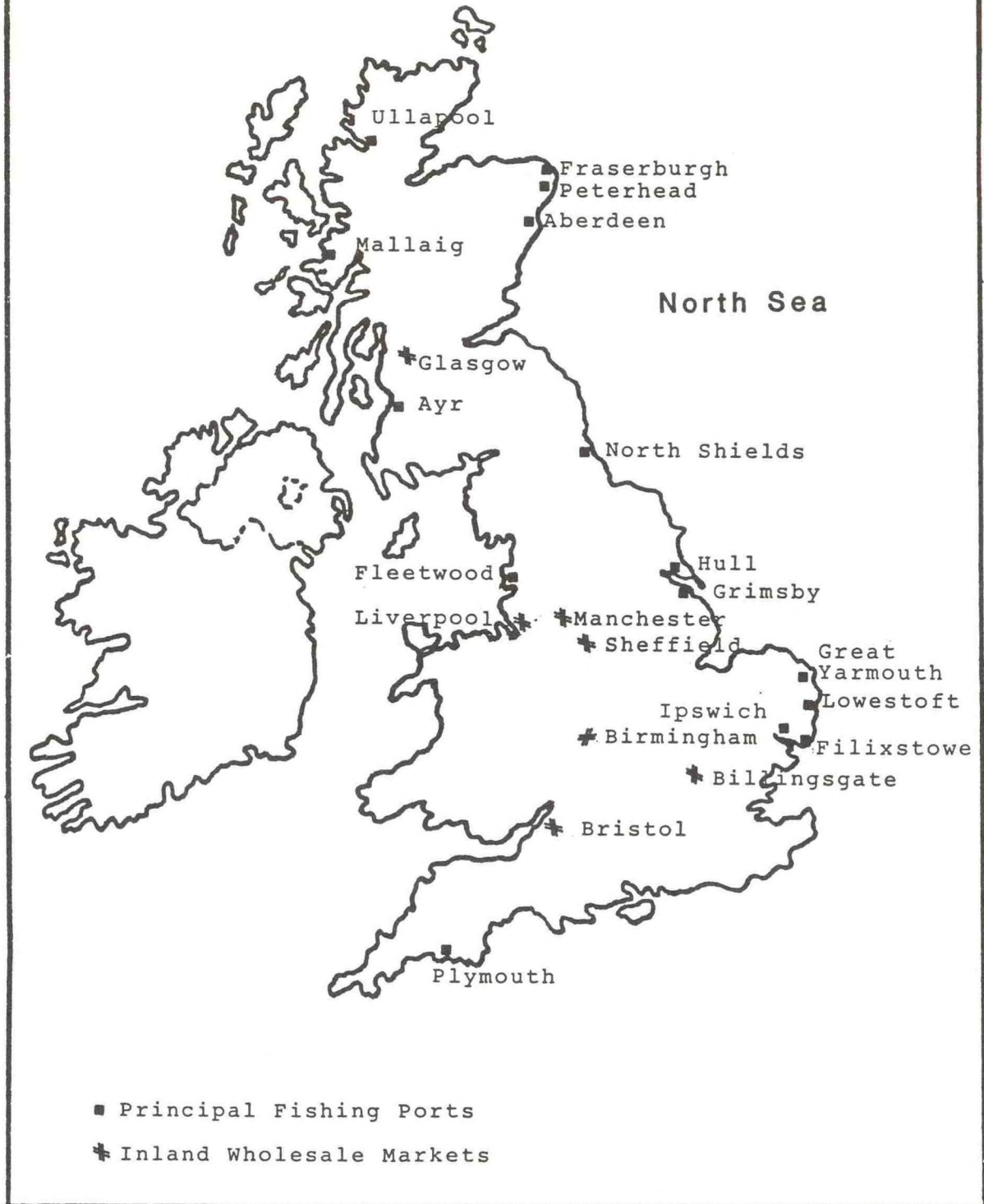
Figure 1. Principal fishery ports and inland wholesale markets in the United Kingdom.