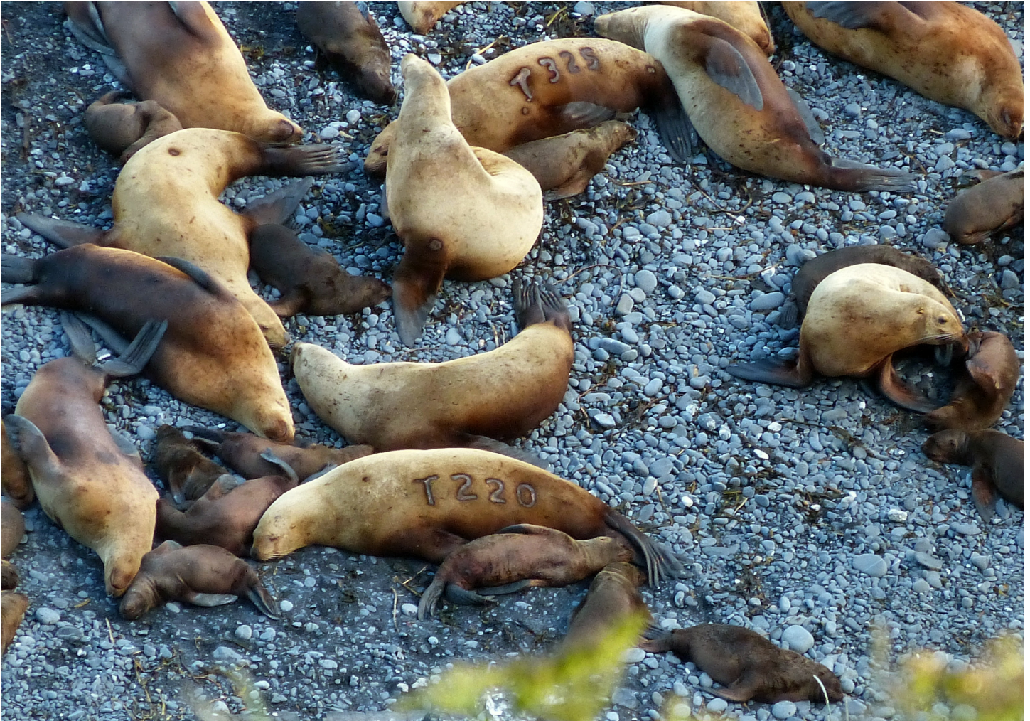
Fig 2. A group of Steller sea lion mothers and pups viewed from a resight location on Marmot Island. Two permanently marked adult females (T220 and T325) are visible with pups laying at their side.

https://doi.org/10.1371/journal.pone.0189061.g002