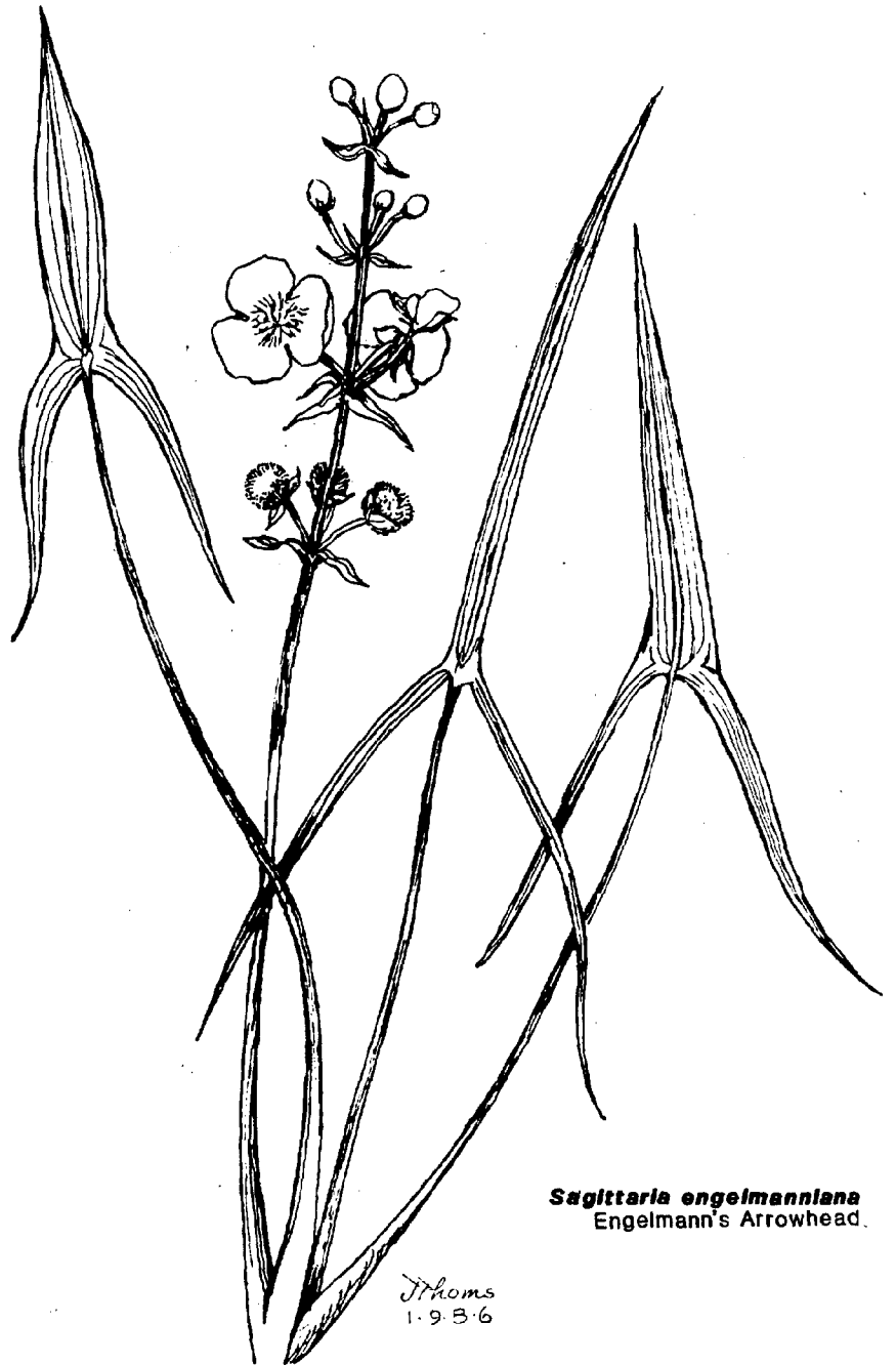
Sagittaria engelmanniana Engelmann's Arrowhead.