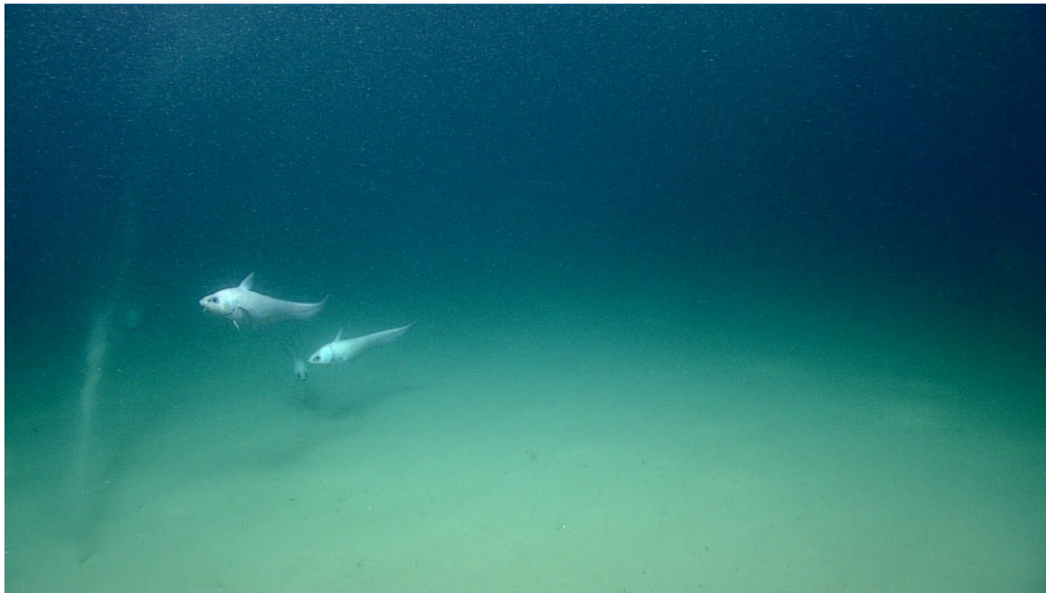
A few Coryphaenoides armatus fish that were commonly seen throughout the dive