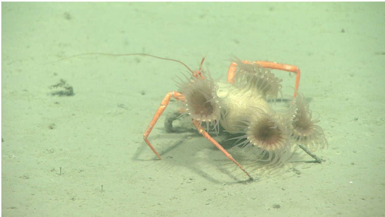
A hermit crab (Paguridae) with zoanthid ( Epizoanthus sp. ) "house"