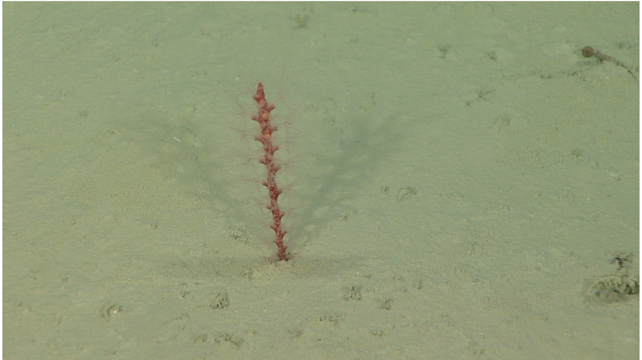
Seapen (Order Pennatulacea) in the soft sediment bottom