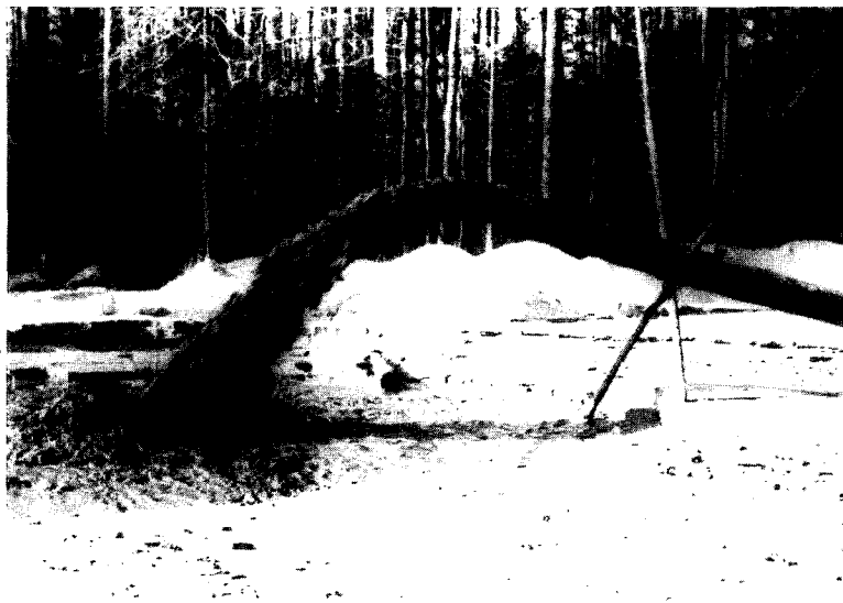
The proper design and construction of dredged material placement areas can avoid many environmental impacts.

In making these decisions, extenuating circumstances or any other relevant information either pro or con not mentioned in the above