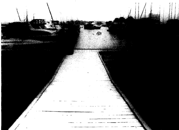
Access to navigable water should be achieved by piercing across wetlands rather than dredging and filling.

Canals, particularly long convoluted residential canals, which are dredged into uplands are very prone to developing water quality problems. Their extreme length makes it difficult for material introduced at the head to be flushed out of the canal. This leads to an accumulation of both organic materials and nutrients which are washed into the canal from the adjacent uplands. As the organic material decays it requires oxygen for decomposition. This increases the biochemical oxygen demand (BOD) in the water and reduces the amount of dissolved oxygen available, particularly during the summer when water temperatures are high. Added to this problem is the abundance of nutrients also present in the canal. These nutrients stimulate the growth and reproduction of phytoplankton until bloom conditions are eventually reached. This is not a problem during the day when there is so much photosynthesis that the dissolved oxygen levels become saturated. The phytoplankton population continues to expand until one night there are so many phytoplankters in the water column that there is not enough oxygen dissolved in the