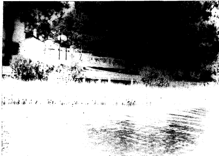
Whenever possible, shoreline defense structures such as bulkheads should be placed landward of wetlands.

Groins and jetties almost always precipitate rapid responses along adjacent shorelines. The characteristics which have the most influence on these responses are the length of structures, their height and the distance between the structures. Some design considerations such as being low profile, spurs and T-heads can measurably reduce impacts and increase the effectiveness of the structures. The proximity of similar