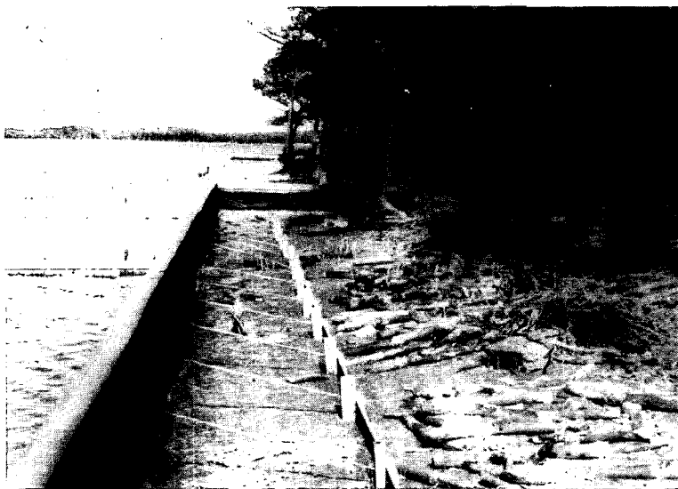
The proper design and construction of a bulkhead include the use of tiebacks and filter cloth.

Fish and wildlife resources generally receive the most severe impacts from construction activities because the two are seldom compatible. The loss of wetlands and subaqueous habitats are usually of the greatest concern. These areas provide much of the primary production which supports aquatic food webs. They are also the pri-