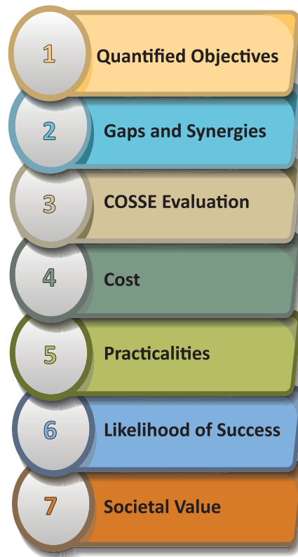
Figure 2. For each societal need, activities can be identified to specify the observing system which supports the societal impact. The goals of monitoring the Earth, advancing climate processes, and improving climate prediction can result in a robust observing system that serves science and society in a cost effective, fully justifiable manner.

thoughtful engagement of the community, building from existing efforts, and respecting current organizational structures. Carefully conceived activities can help change the paradigm for developing observing systems to support climate science from an ad hoc, sometimes engineering-driven approach to a scientifically driven set of decisions that assure appropriate investment in needed observations. We identified a number of activities that can help achieve this goal.