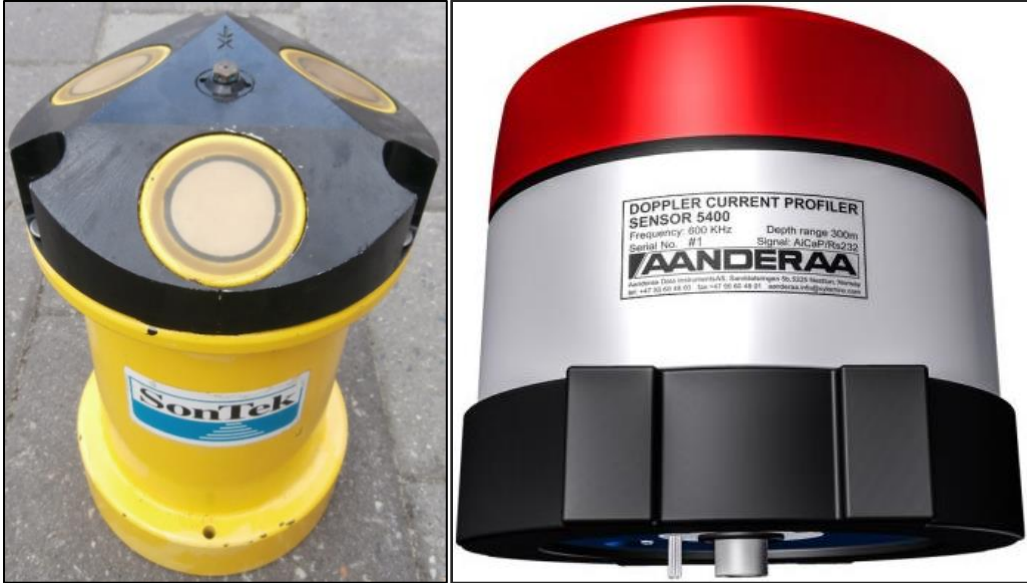
Figure 2-2. SonTek ADP (left); Aanderaa Doppler current sensors (right).