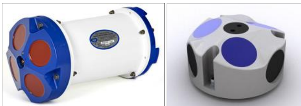
Figure 2-1. Teledyne RDI ADCP (left); Nortek Aquadopp transducer head (right).

Acoustic Doppler current meters and profilers may have two (the minimum required for horizontal profiling), three, four, or more transducers. In some cases, redundant transducers over-resolve the current measurements, and the results are used to provide an estimate of the quality of the observations. In other cases, multiple transducer pairings utilize different transmit frequencies and provide the benefits of longer range from a lower frequency and higher spatial resolution from the higher frequency (e.g., SonTek RiverSurveyor M9). Some can also be configured to measure other variables as well, such as waves, turbulence, ice tracking (e.g., Nortek Signature500) and biomass (e.g., Nortek Signature100). Some examples of the variety of transducer configurations are shown in figs. 2-1 through 2-5. This manual does not cover the QC of all possible configurations, but it does include the most widely used tests provided by participating operators. Notes within each specific test provide application guidance.