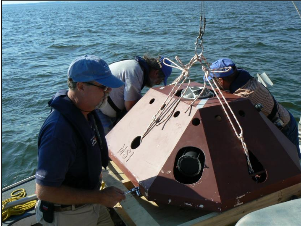
Figure 2-4. A bottom-mounted upward-looking Nortek AWAC is prepared for deployment.