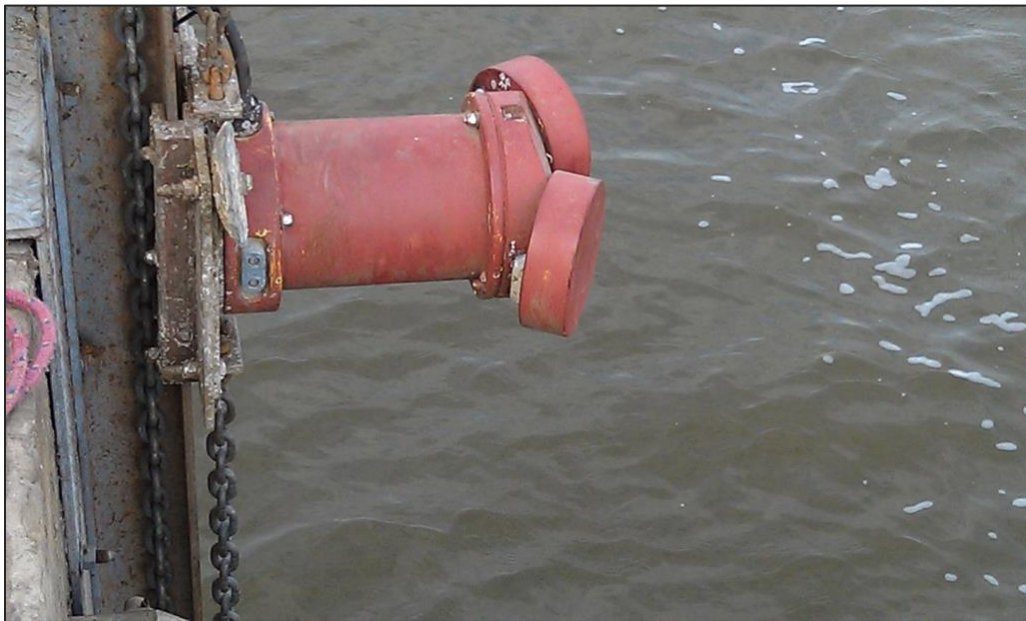
Figure 2-5. A SonTek side-looking ADP is raised for cleaning.