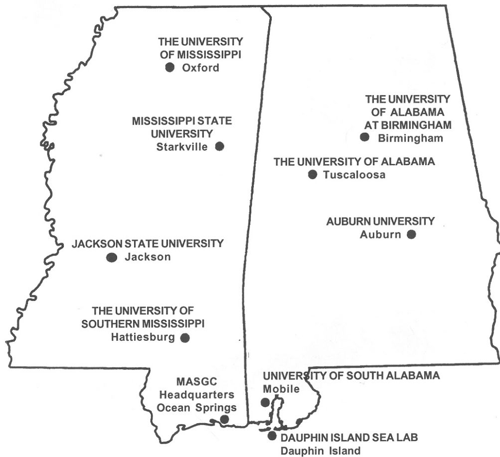
Mississippi-Alabama Sea Grant Consortium member universities and laboratories and their locations in Mississippi (left) and Alabama.