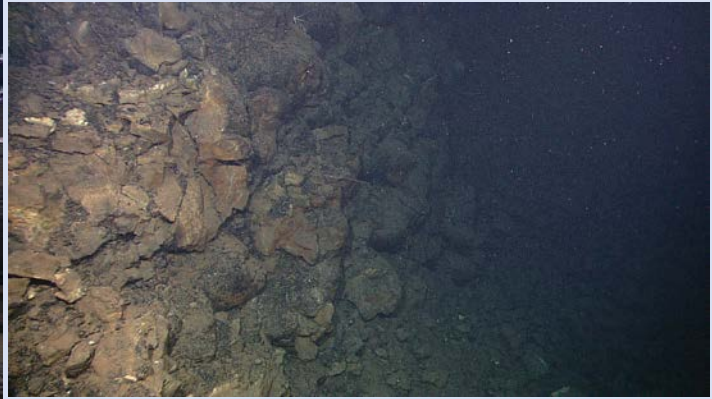
Much of the dive included pillow lava covered with heavy sediment.