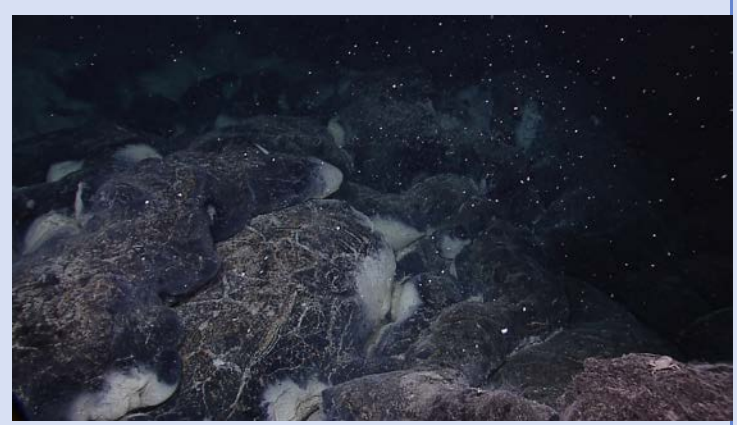
A recent lava flow showing white microbial staining on the broken basaltic rocks, caused by discharge of warm hydrothermal fluids through the seafloor. White flocculent in the water column.