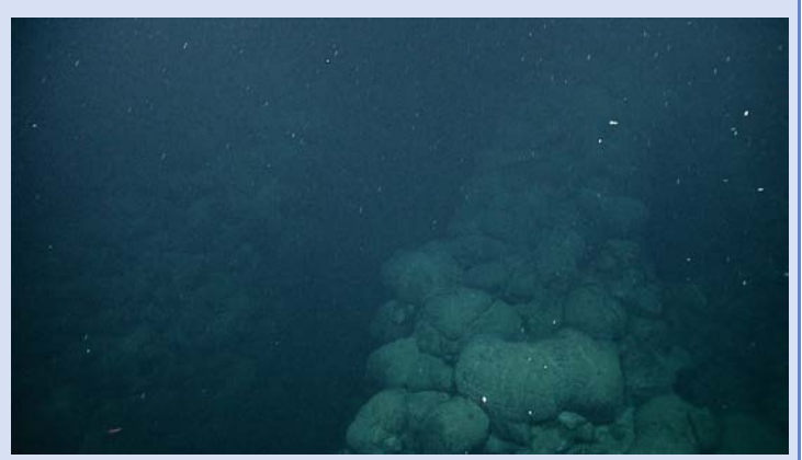
Downlooking view into the graben.