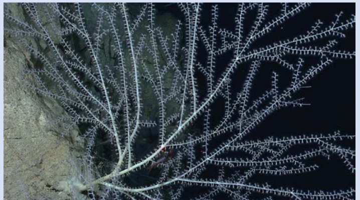
Detail of the branches of a gorgonian coral showing the distribution of polyps down the branches