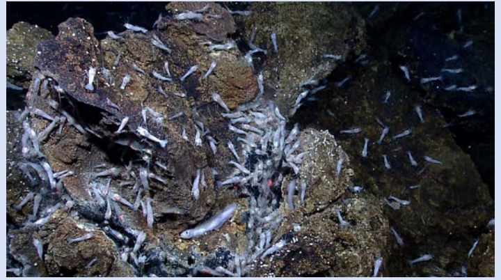
Concentrations of shrimp and a single zoarcid fish on the southern side of the Von Damm central Spire.