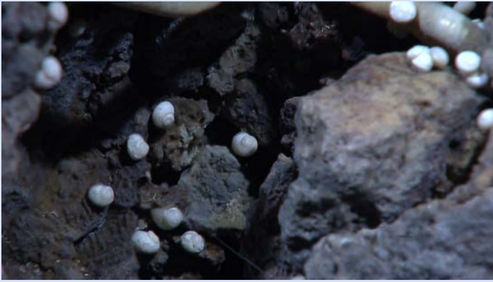
Small gastropods (snails) in hydrothermal fluid. Each one is about 8mm in diameter.