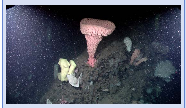
EX1102_IMG_20110422T190725Z_ROVHD_PINK_SPONG_FLYBY Rock outcrops encountered during the dive were covered in diverse invertebrate fauna, predominantly sponges, soft corals, large light bulb tunicates and occasional crinoids.