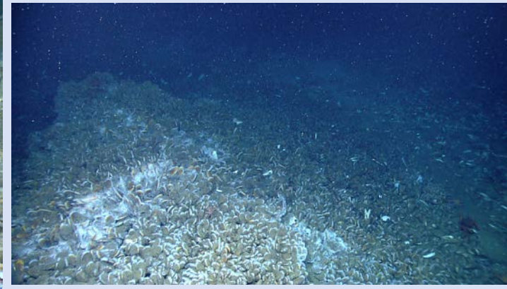
An extensive mussel bed near WP2.