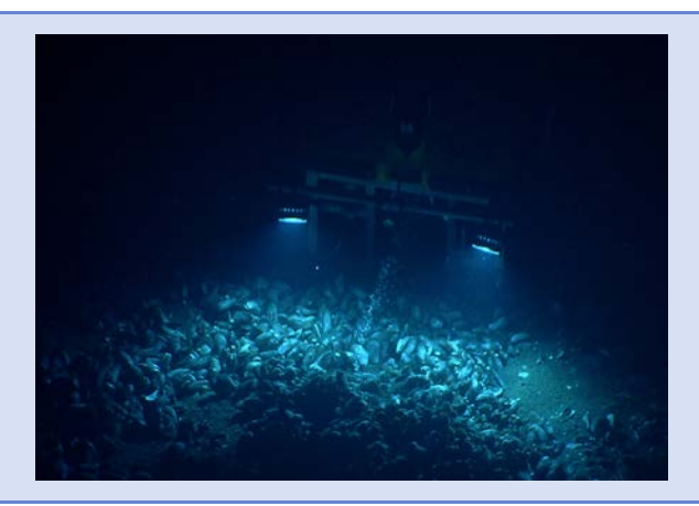
A view from the Seirios camera of Little Herc over top of an extensive bed of living and dead mussels where we were to conduct the gas capture experiment.