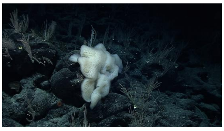
Unique hexactinellid (glass) sponge observed during the dive.

Specimen of Corallium sp collected from the beautiful high density community encountered on the ridge crest.