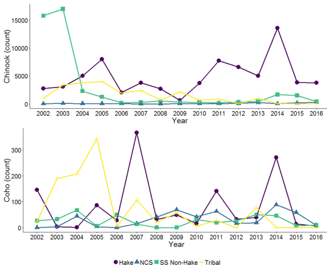
Figure 1. Trends from 2002–16 for Chinook and Coho salmon bycatch in fisheries observed by the A-SHOP, CM, and WCGOP. Hake consists of at-sea catcher processors, at-sea mothership catcher-vessels, and shoreside catcher vessels. NCS consists of non-catch shares exempted fishing permits, sablefish primary, nearshore, open access California halibut, and pink shrimp. SS Non-Hake consists of shoreside limited entry (LE) and catch shares (CS) bottom trawl, CS fixed gear, CS midwater rockfish, and LE California halibut. Tribal consists of tribal mothership catcher-vessels and tribal shoreside processors.

Coho salmon bycatch in the hake fishery has been variable, with highs in 2007, and 2014. In other years, bycatch has been relatively low. Bycatch in the NCS and shoreside non-hake fisheries have remained at moderate levels across all years. Tribal bycatch was high from 2003–05, but has remained moderate across most years with little to no fishing effort in the mothership catcher-vessel sector from 2012–17. Zero bycatch from 2014 to 2016, largely due to extremely low fishing effort in recent years.