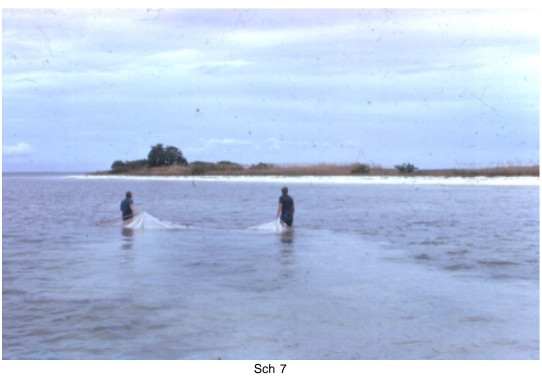
Photograph 8. Tom Schmidt and Tom Habblett beach seining at Little Sandy Key, Florida Bay.