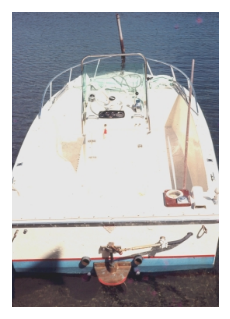
Photograph 9. SeaLark, work boat for Florida Bay study.