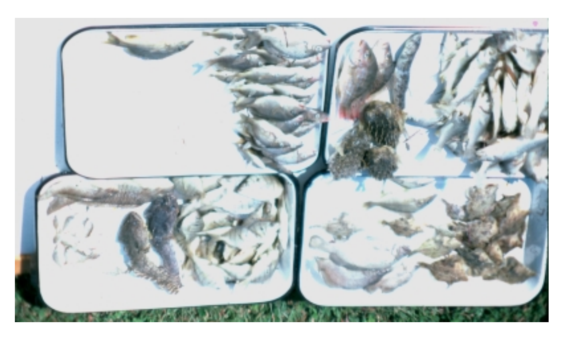
Photograph 9. Sorting trays.