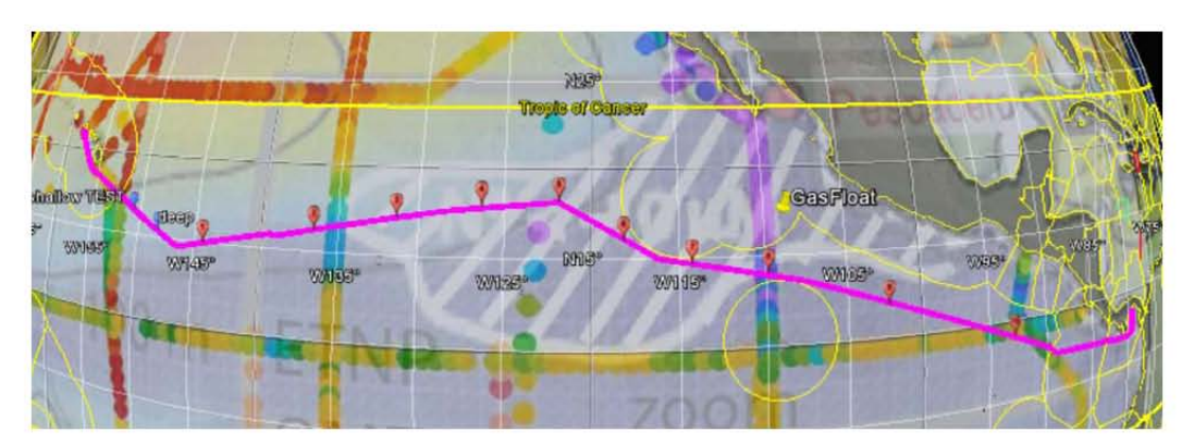
Figure 1: Map showing approximate locations of 10 CTD stations (red icons) along the cruise track. We would like to perform two test casts (blue icons) early on in the cruise, one shallow (~200 m) and one deep (600 m) to provide training to all operators and ensure proper operation of the sampling equipment.

Our targeted sampling region is the shaded white region in the upper left corner of Fig. 1. This is a region of high 'excess N_2 '. Also shown are approximate locations of our 10 CTD stations and two test stations. The exact locations will be informed by the data we collect and other constraints (weather, other science operations, ship's daily routines, etc.)