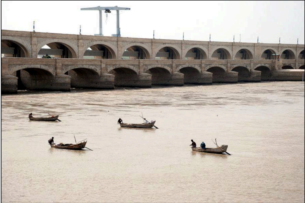
Figure 2. Sukkar Barrage, Pakistan: Source: Hafeezullah, Wikimedia Commons.