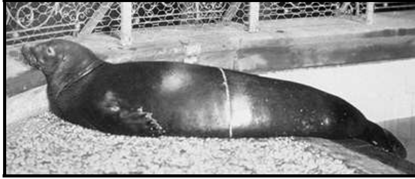
Figure 1. A 1910 photograph of Caribbean monk seal at the New York Aquarium. Specimen captured in Campeche Bank region as described in Townsend (1909).

Caribbean monk seal vocalizations have been described as roaring, pig-like snorting, moaning, dog-like barks, growls, and snarls (Gosse 1851, Hill 1843, Nesbitt 1836, Townsend 1909). Pup vocalizations have been reported as a long, drawn out, guttural “ah” with a series of vocal hitches during enunciation (Ward 1887). Underwater vocalizations of Caribbean monk seals have not been described and are unknown. As with both Hawaiian and Mediterranean monk seals, Caribbean monk seals apparently became sensitized to human presence after exposure to hunting or other abusive treatment. Thus, although many recent descriptions of monk seals state that they are highly sensitive to human disturbance, some accounts, including early accounts of the species (e.g., E.W. Nelson, as cited in Adam and Garcia 2003), describe them as being very approachable when hauled out on beaches.