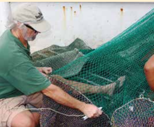
Top and bottom, Researchers from Texas A&M University test prototypes of new bycatch reduction devices in the shrimp fishery.

Atlantic bluefin tuna (ABT) is under strict management regulations at both domestic and international levels to help ensure the survival of this species. In the United States, ABT are often caught in longline fisheries targeting swordfish in the Atlantic and Gulf of Mexico. GeoEye Imagery Collection Systems, Inc., is using Geospatial Preference Modeling to collect data that will be used to develop an ABT Avoidance System for use in the North Atlantic pelagic longline fleet. Data are being collected on environmental preferences for ABT, reproductive states, and oceanographic conditions to help identify “hotspots” of ABT habitat. The goal of this research is to better understand ABT movements and behavior, as well as determine the viability of using an avoidance system to help reduce bycatch of ABT while maintaining catch of targeted species (such as swordfish).