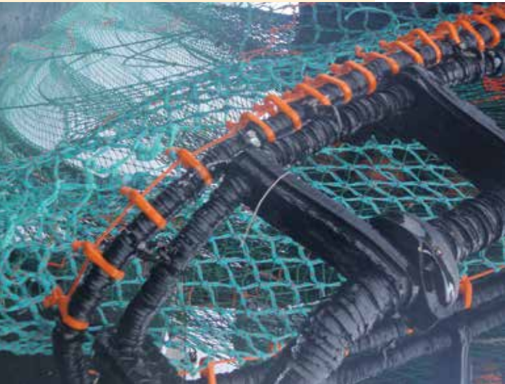
Researchers from the University of Massachusetts Dartmouth are testing this modified trawl to reduce yellowtail flounder and juvenile cod bycatch in the Georges Bank large mesh groundfish fishery.

Researchers from the University of Massachusetts Dartmouth are testing a modified trawl to reduce yellowtail flounder and juvenile cod bycatch in the large mesh groundfish fishery on Georges Bank. The annual catch limit for Georges Bank yellowtail flounder was reduced by 80 percent in 2012, and discards of juvenile cod are one factor hindering the rebuilding of this overfished stock. A new trawl was developed with escape windows installed at the center to allow yellowtail flounder and juvenile cod to escape before entering the trawl. This gear was tested along with unmodified gear in June 2013. Preliminary analyses indicate that the modified gear caught less flounder and juvenile cod than unmodified gear, but the modified gear also caught less legal-sized cod. By using this modified gear, fishermen potentially could reduce yellowtail flounder and juvenile cod discards and make the most of their limited catch allocations in the groundfish fishery.