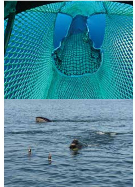
Top, Researchers from the Pacific States Marine Fisheries Commission (PSMFC) test the use of artificial light to encourage salmon to use an escape flap on Pacific hake nets. Bottom, Researchers from the New England Aquarium test how using different colored ropes help right whales avoid entanglement with fishing gear.

The Gulf of Maine Lobster Foundation collaborated with Maine lobstermen to reduce interactions between lobster gear and right, humpback, and fin whales. The Maine lobster fishery is worth $300 million annually and uses lobster traps that are attached to buoys (fixed gear). Fixed gear is commonly used in several economically important fisheries, including lobster. Sometimes whales are injured or killed if they become entangled in the lines that connect the trap to the buoy. With this award, the grantees collected information about the