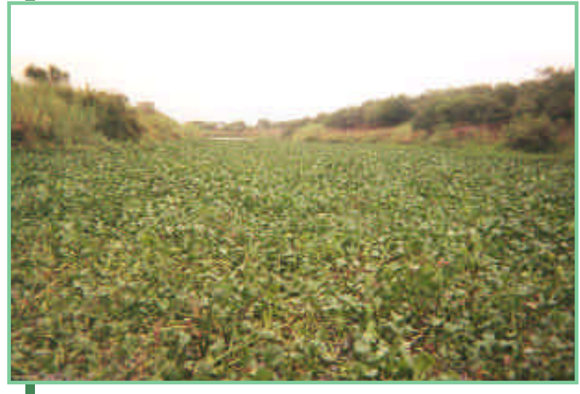
Left, photo of water hyacinth blockage on the Rio Grande upstream from Brownsville, Texas

Texas should either expand the Aquatic Vegetation Management Fund to include all aquatic nuisance species or establish a separate fund to defray the costs associated with management of invasive fish, shellfish, and wildlife.