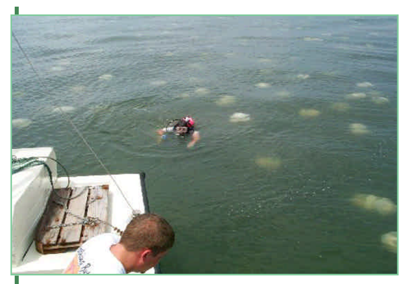
Photo of jellyfish invasion at St. Joseph reef in Hancock County, MS

authority over aquatic species. The DWFP is authorized to destroy any walking catfish or piranhas found within the state to prevent the introduction of those species into state waters. Mississippi also has a notification requirement. If non-native aquatic species are released from an aquaculture operation, the operator is required to notify the DWFP so that control and eradication efforts can be mounted.