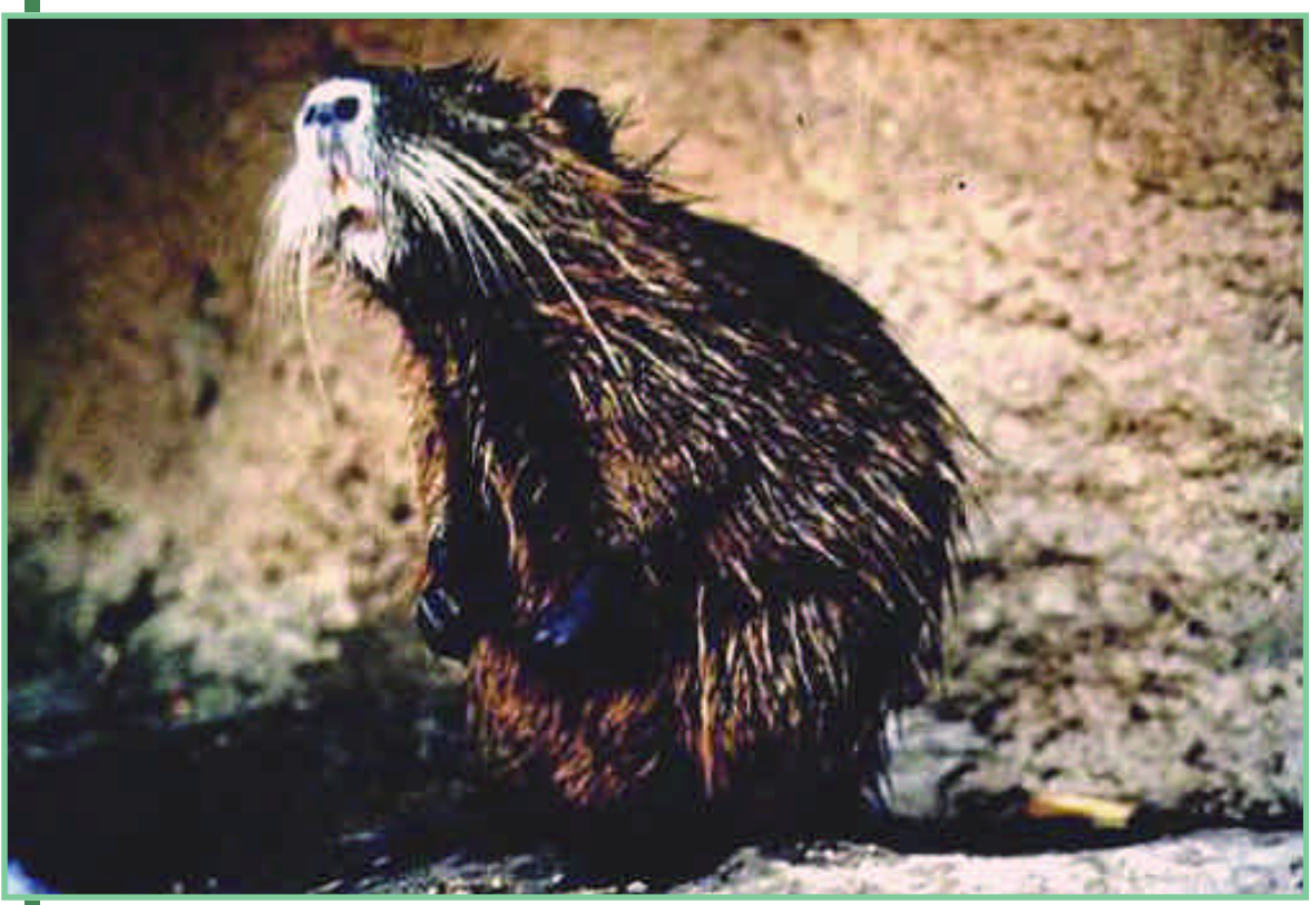
Photograph of nutria courtesy of the Environmental Protection Agency.

required to possess, sell, transport, or release any species not approved by the Department of Wildlife and Fisheries. Louisiana should also considered extending the bond requirement to the possession, import, and transportation of other risky aquatic species.