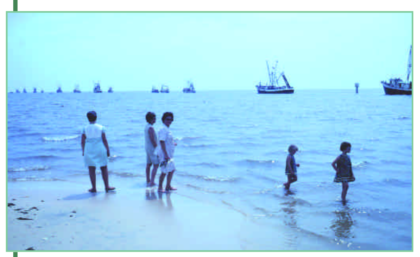
Photo of shrimp boats proceeding to sea after the blessing of the fleet at Bayou la Batre, Alabama

Because no funding mechanism exists to help defray the costs of ANS management, a trust fund should be established to help DCNR fund control, management, and enforcement programs. Any money generated from the prosecution of violators could be used to maintain the Trust Fund.