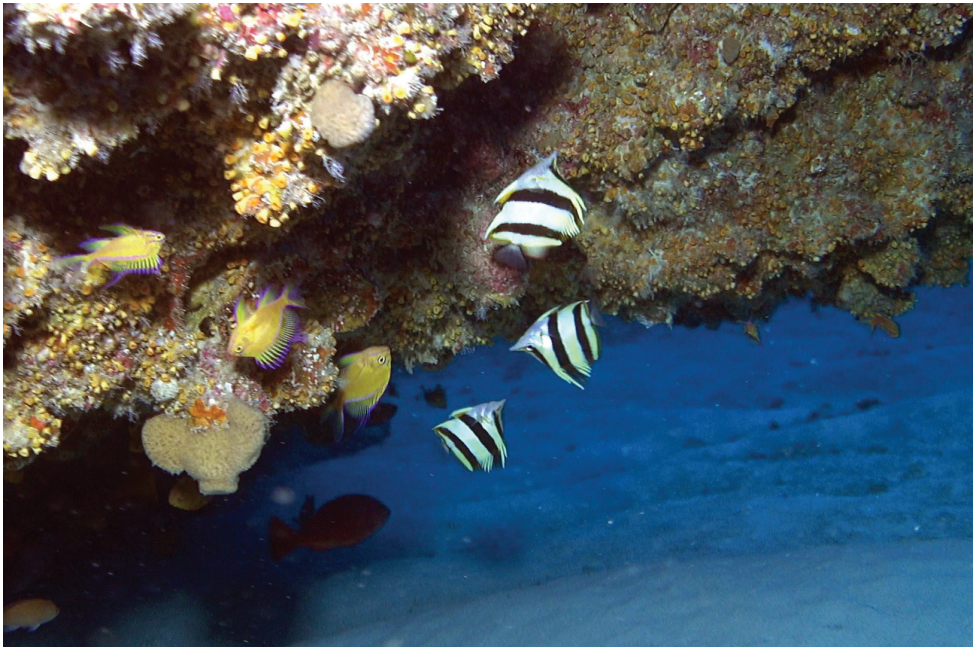
Figure 5. A group of three Prognathodes basabei at a depth of 90 m off Pearl and Hermes Atoll, Northwestern Hawaiian Islands.