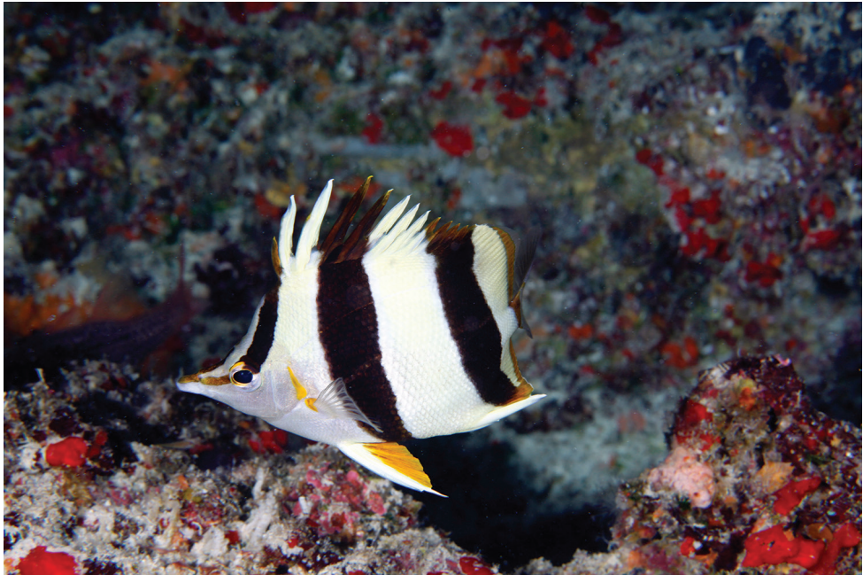
Figure 3. Prognathodes basabei at a depth of approximately 55 m off Pearl and Hermes Atoll, Northwestern Hawaiian Islands.

and more generally for his extensive contributions and assistance to many researchers (especially the authors) in the ichthyological community.