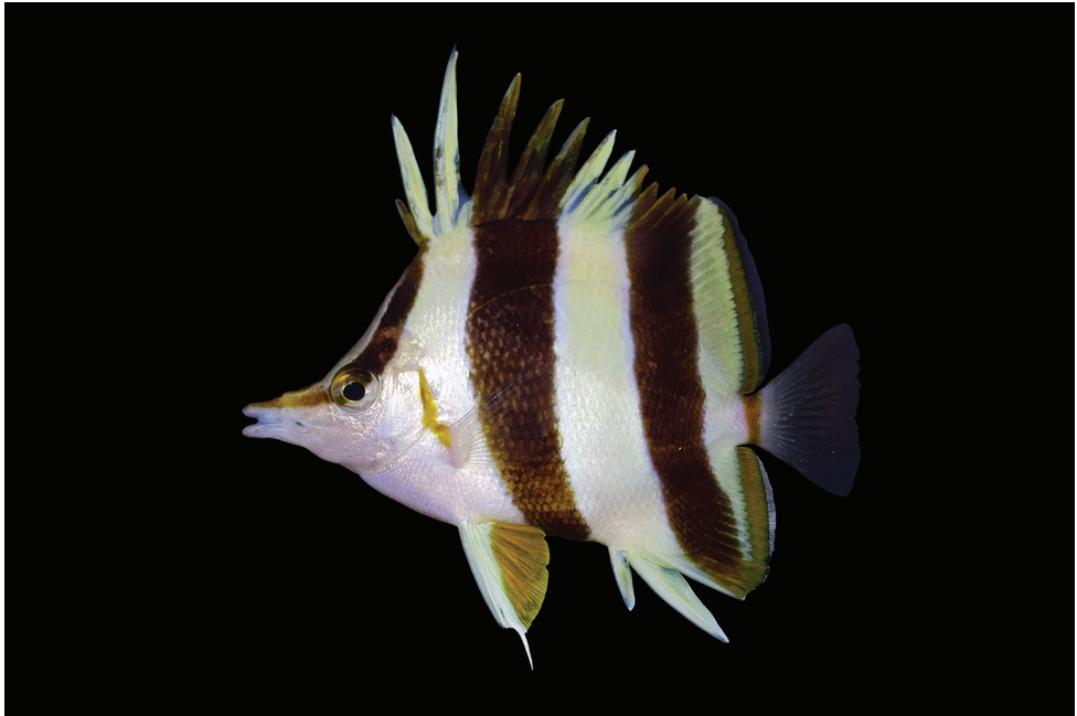
Figure 1. Holotype of Prognathodes basabei (BPBM 41290), collected at a depth of 61 m off Pearl and Hermes Atoll, Northwestern Hawaiian Islands.

mm SL, same location, depth, habitat, collector, vessel, cruise and collecting method as holotype, 14 September 2015; USNM 440272, GenBank KX783256, Barcode of Life PROBA002-16, same data as holotype.