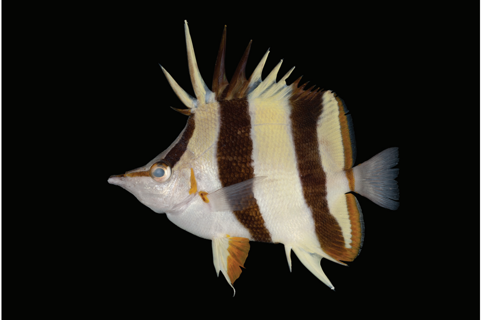
Figure 2. Paratype of Prognathodes basabei (BPBM 41285-1), collected at a depth of 55 m off Pearl and Hermes Atoll, Northwestern Hawaiian Islands.

first anal-fin soft ray the longest, its length 1.35 (1.39–1.62) in head, anal-fin soft rays progressively shorter posteriorly; caudal fin slightly convex with a slight concavity at the mid-line, its length 1.79 (1.83–2.00) in head; pectoral fins 1.37 (1.26–1.43) in head; pelvic spine 1.38 (1.36–1.51) in head; first soft ray of pelvic fin with a filamentous extension, its length 1.08 (1.19, broken in all but one paratype) in head.