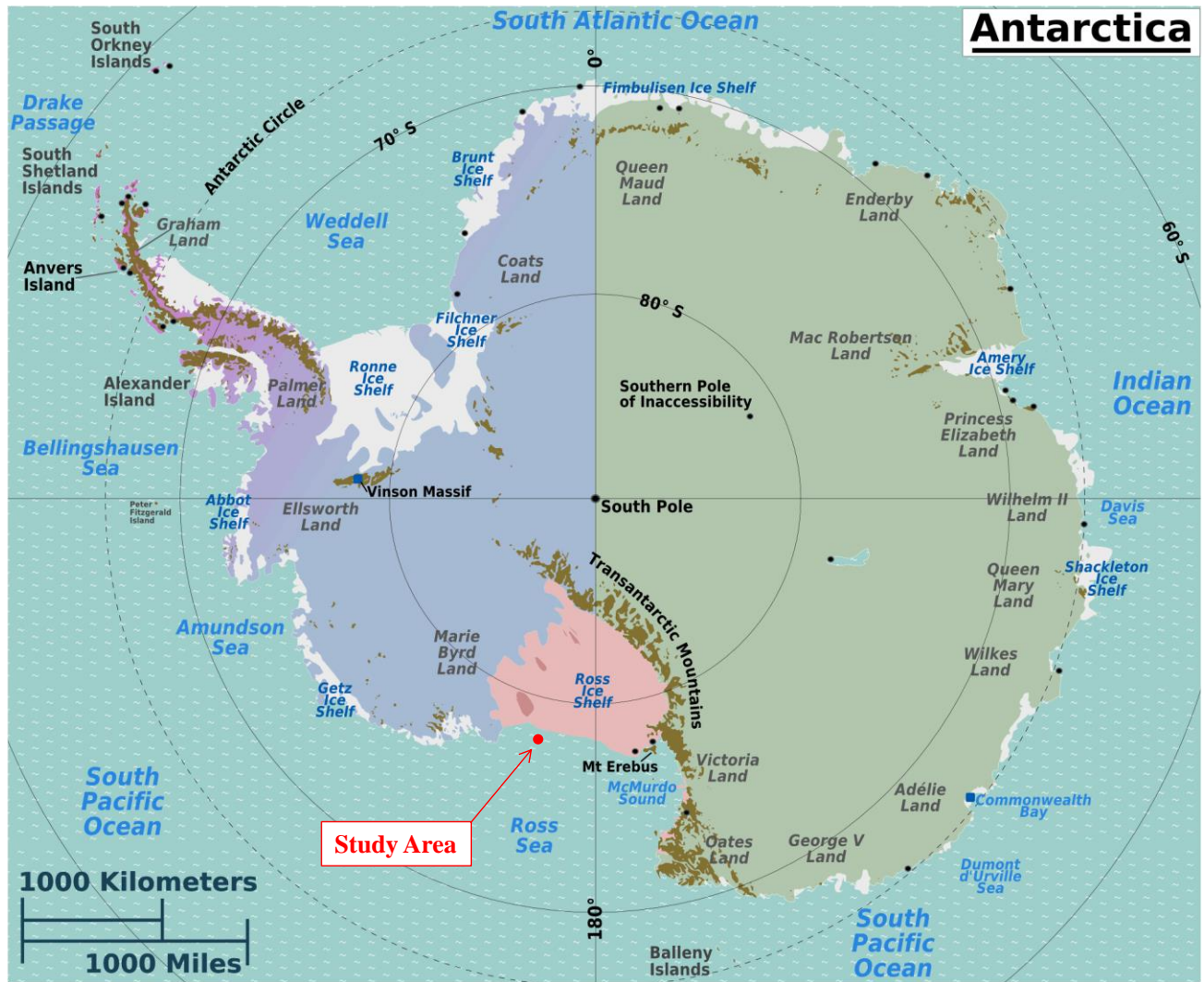
Figure 1. Ross Sea study area.