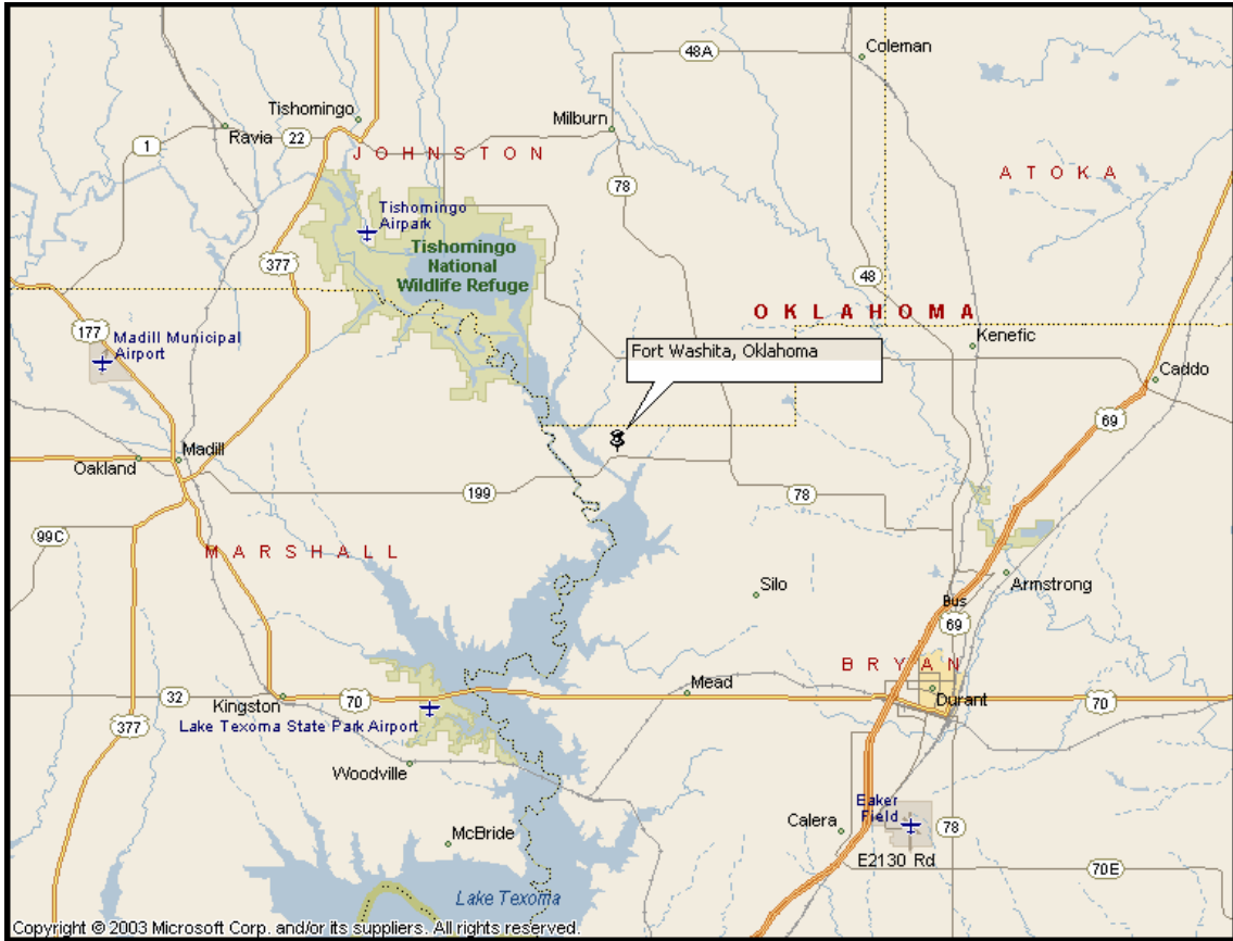
Figure 1. Location of Fort Washita on a current map of southern Oklahoma.

The Fort Washita site was selected by General Zachary Taylor in 1841. After surveying the area, the General selected a site on a knoll located one and one-half miles east of the Washita River. The fort was occupied in April 1842.