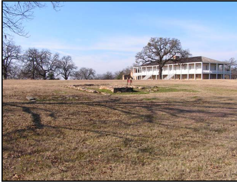
Figure 3. Stone foundation remains of old hospital (center of picture) looking northwest. Reconstructed South Army barracks is in the background. Fort Washita weather observations likely were taken at this location from Jul 1842 through early 1857.

reports in the mid 1850s indicating an east-west orientation (consistent with current ruins), suggesting that the building likely was torn down and rebuilt at the same location.