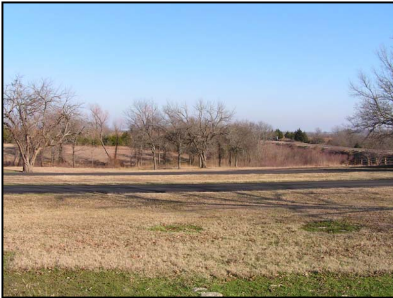
Figure 4. View from old hospital building looking southeast toward gully. Elevation drop from the hospital building to the bottom of the gully is approximately 30 feet. U.S. Highway 199 is shown on the right side of picture (highway oriented east-west).