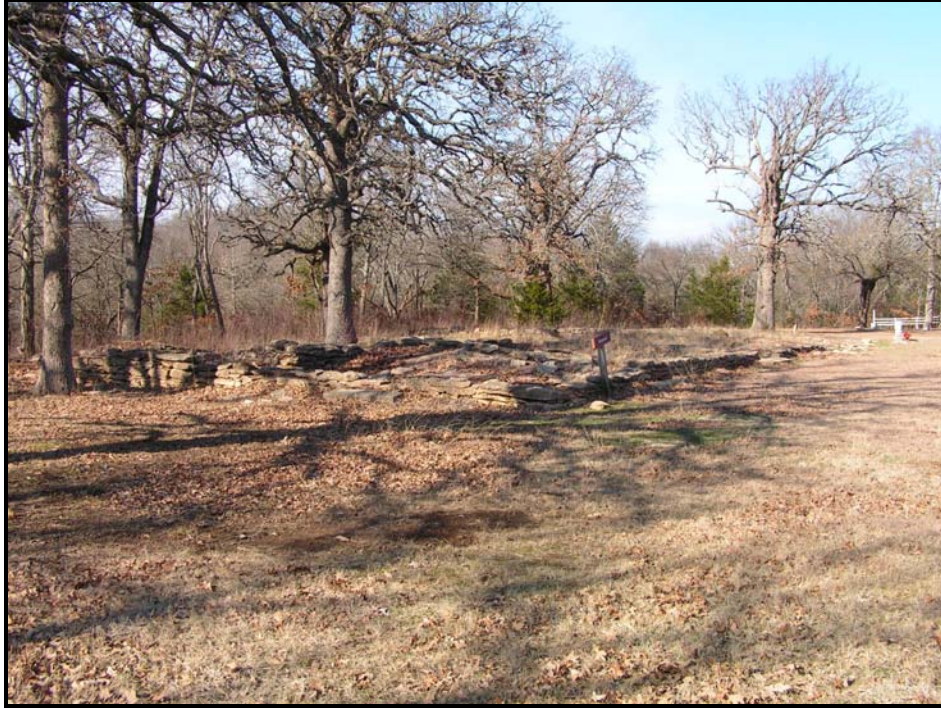
Figure 6. Close-up of remains of stone foundation of new hospital. View is towards the northwest with the northeast-southwest gully in the background.