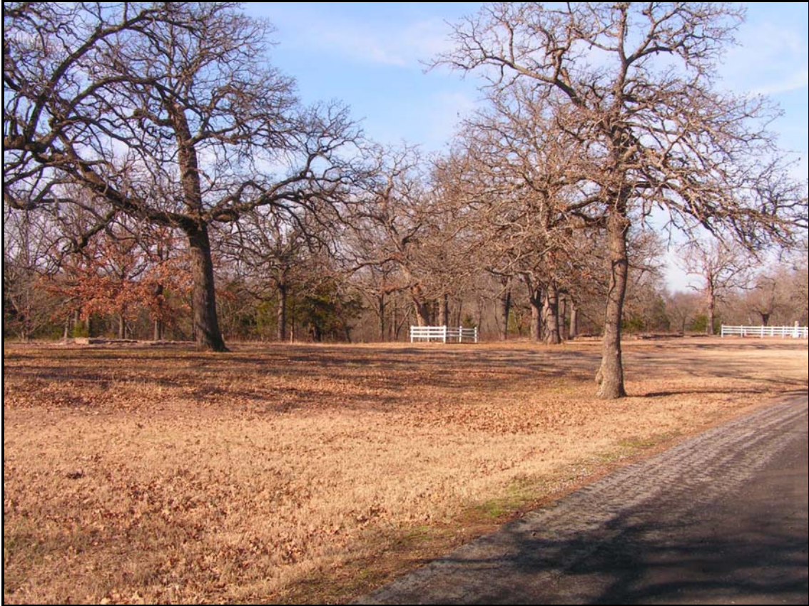
Figure 5. Stone foundation remains of new hospital (right side of picture) and surgeons' quarters (left side of picture). View is looking northwest.

In 1856 a new hospital was constructed approximately one-quarter mile north of the old hospital (see Figure 2). This hospital was constructed of brick and stone, was one story high, had eight rooms, and was surrounded by a porch. GPS coordinates for this building are 34°6'19"N 96°32'45"W with an elevation of 774 feet. The new hospital was located at the northern end of the post (Figures 5, 6, and 7) with terrain immediately behind the hospital (west) sloping approximately 50 feet to a gully below.