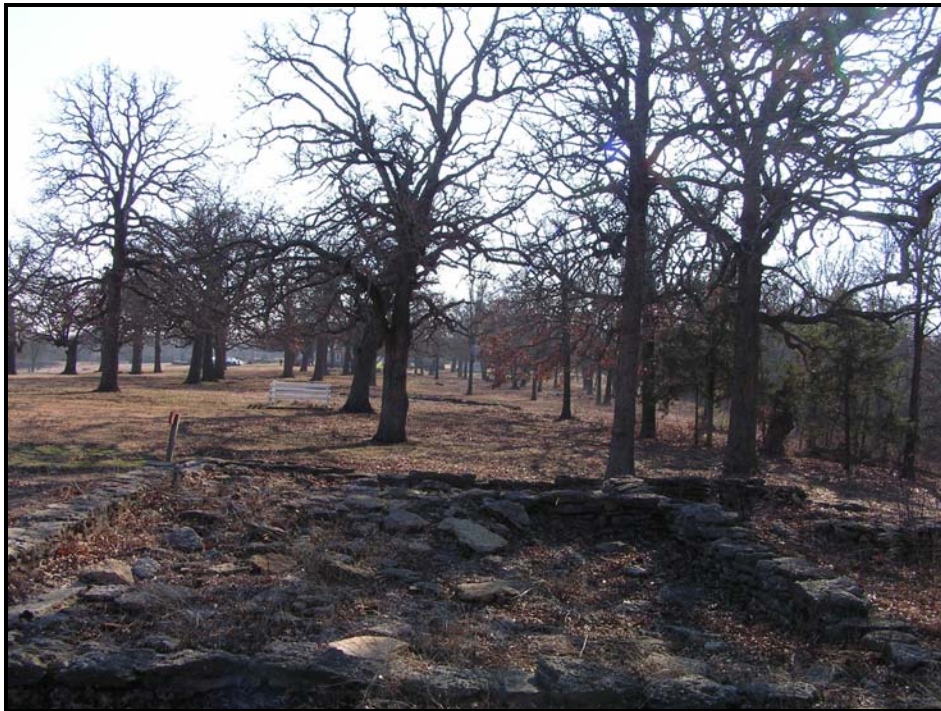
Figure 7. View of south direction from new hospital along the knoll containing Fort Washita and towards the old hospital.